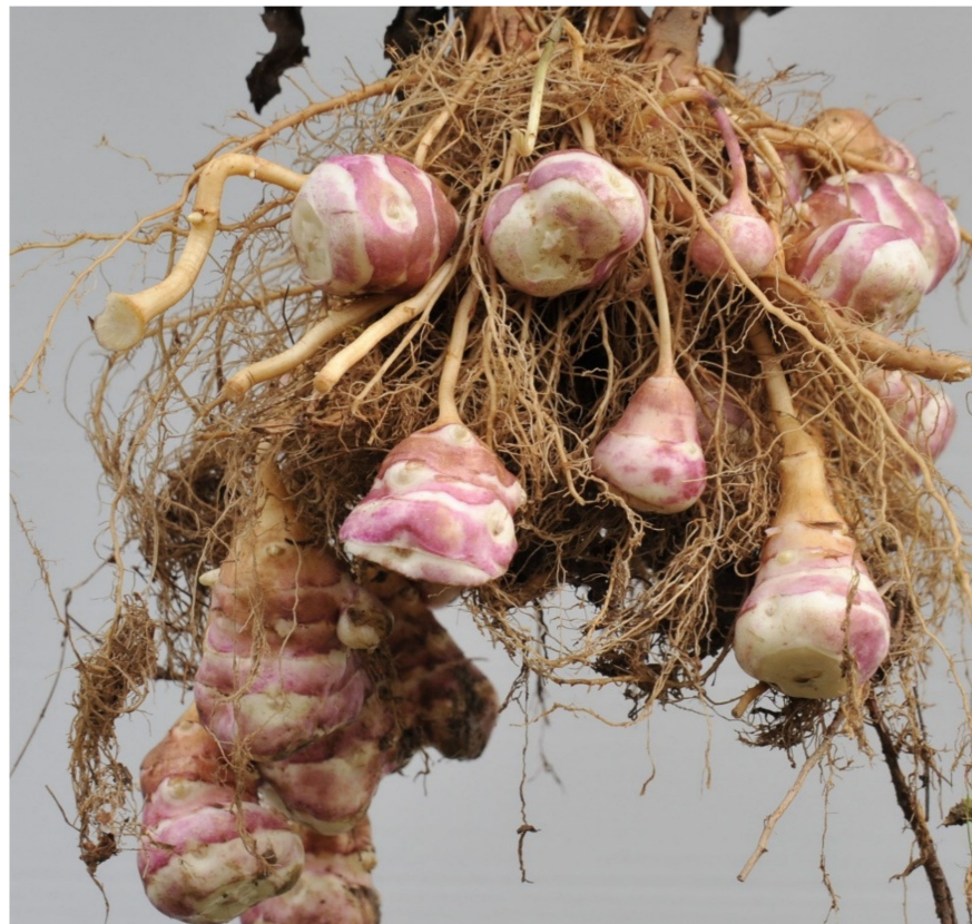
Figure 2. Tubers, stolons, roots, and rhizomes of the 'Rubik' cultivars of H. tuberosus .