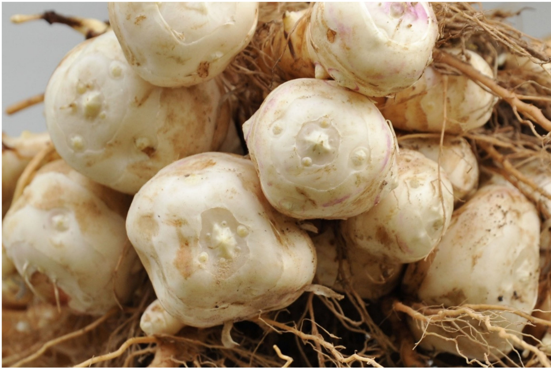
Figure 1. Tubers, stolons, roots, and rhizomes of the 'Albik' cultivar ( H. tuberosus L.).