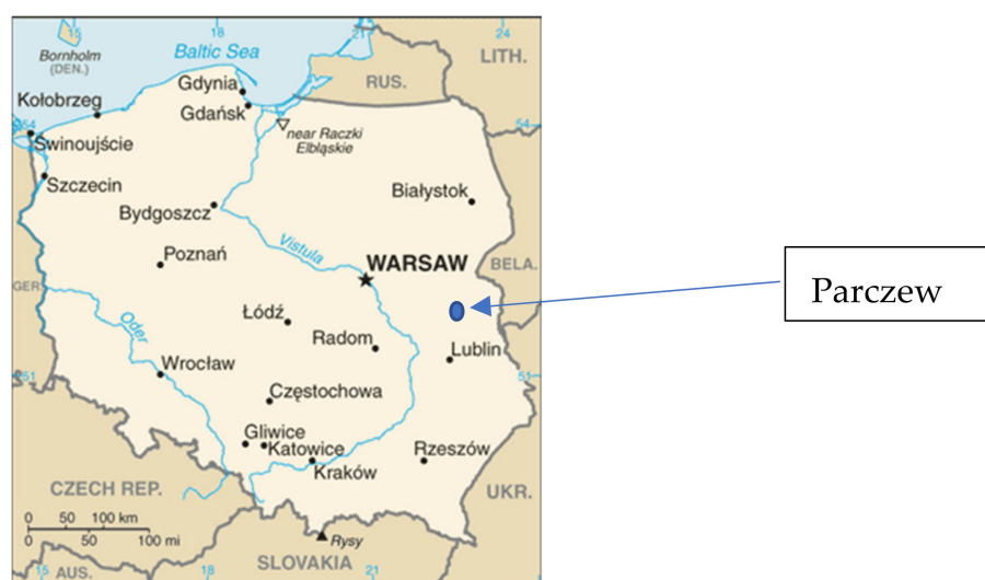
Figure 4. Geographical location of Parczew.