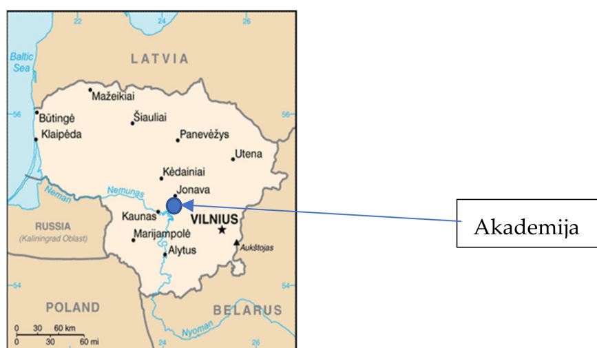
Figure 3. Geographical location of Akademija.

The village of Akademija is located in the central part of the country on the Central-Lithuanian Plain on the Neuman's River and to the west of the Kaunas reservoir (Figure 3). In the village of Akademija, the soils under cultivation can be classified as Haplic Luvisol [12]. On the loam of Haplic Luvisol, however, the humus content is around 2.0%, and the soil pH is slightly acidic. According to the SPI results, droughts in the Akademija region occur in 15% of all months in the Kaunas region, and wet periods—in 16% of all assessed months. According to the SPI assessment, 70% of the total months in the study period in Kaunas were almost normal. The probability of an extremely dry period in Lithuanian climatic conditions is quite low—3.0% in central Lithuania [33].