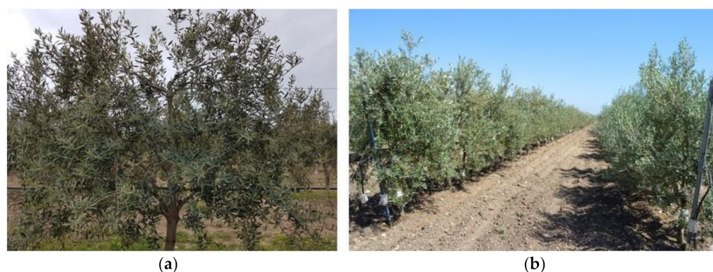
Figure 2. Example of high-density “pedestrian olive orchard” in southern Sicily: (a) ‘Calatina’ olive tree trained to “free palmette”; (b) continuous walls of “Calatina” trees trained to “free palmette”.

After more than 15 years of trials with a wide array of Sicilian cultivars with different vigor, growth and fruiting habits, the results obtained with this new type of planting, which we call “pedestrian olive orchard” similar to fruit crops, are definitely interesting; hence, the cultivation model is to be considered mature to be further investigated. From recent trials with a selected number of major and minor Sicilian genotypes, low vigor cultivars that are early fruiting, highly productive, with flexible, weeping branches have resulted in the most suitable for high-density pedestrian olive orchards. For example, minor cultivars like Calatina planted at 5 \times 2 m have reported more than twice the yield efficiency (in kg of olives per m^3 of canopy) and yield per ha compared to major cultivars like Nocellara del Belice (Caruso, unpublished data) over the first six years from planting. It is, therefore, generally believed that in the various olive-growing areas of the world, the model should be developed with low vigor, native cultivars to be more easily transferred to growers with specific indications on the cultivation protocols to be followed in particular pruning, fertilizing, and irrigation. In short, it is a matter of developing, starting from the aforementioned reference model, plantings suitable for specific regional/district areas and this unlike super-intensive plantings, which are based on cultivars with global agronomic potential.