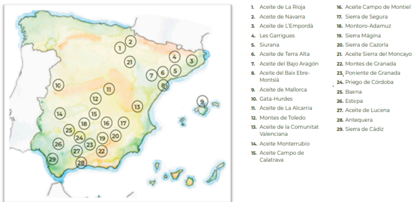
Figure 2. PDO-certified EVOO from Spain. Source: [17].

659 PDOs (excluding wine and spirits) with a registration date prior to 31/12/2020. Of these PDOs, 622 are from one of 24 of the EU-27 countries, since Denmark, Estonia, and Malta have not registered any. In addition, five non-EU countries have PDOs recognised by the EU, after having complied with all the controls and assessments associated with European standards and having passed the European Commission's approval procedure. They are the Dominican Republic (1), China (4), Turkey (4), the United Kingdom (27), and Vietnam (1). The olive oil industry has 112 recognised PDOs as of 31/12/2020, representing 16.99% of the total registered in the EU. As such, the industry ranks third after cheese, with 195 (29.59%), and fresh or processed cereals, fruits and vegetables, with 160 (24.28%). By country, Italy has the most certifications in the olive oil industry as of 31/12/2020, with 42 (37.50%), followed by Spain with 29 (25.89%), shown in Figure 2, Greece with 20 (17.85%), and France with 8 (7.14%).