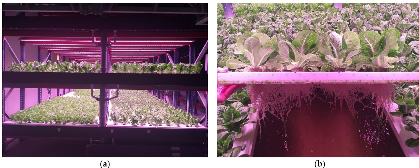
Figure 1. Experimental lettuce cultivation facility on a vertical farm, (a) lettuce grown in hydroponic beds, (b) raft with visible root system of romaine lettuce.

Three-week-old seedlings were planted on specially designed floating polystyrene rafts (0.9 m × 0.6 m) with holes (24 pieces on the raft) for rockwool cubes (Grodan) at a planting density of 40 seedlings per square meter. Plants were grown in hydroponic beds (40.0 m × 1.8 m) arranged on eleven levels, and two hydroponic beds were intended for the experimental study (Figure 1). The depth of water in the hydroponic beds was 15 cm. The multi-level construction for plant cultivation was located in a production hall with a fully controlled atmosphere and no access to sunlight. The temperature was maintained at 23 °C, and the humidity was at 75% RH. The source of light for plants was specially designed LED lamps (70:18:12; Red:Green:Blue), based on the results of our previous study of romaine lettuce [21]. PPFD was 200–220 \mu\text{mol m}^{-2} \text{s}^{-1} , and the photoperiod was 15 h.