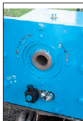
Figure 2. The prototype device.