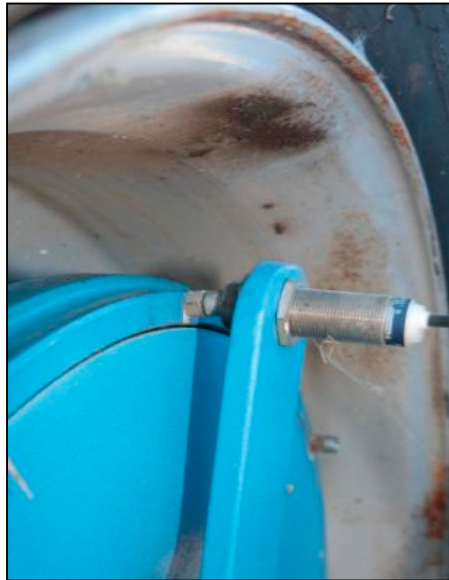
Figure 4. Sensor mounted on the wheel.

Wheel motion detection is achieved by means of a magnetic proximity sensor that detects the passage of the metal surface of the nuts mounted on the wheel drum (Figure 4), which, passing through a distance of 1 to 2 mm, make that sensor generate an electrical pulse that is detected by the microprocessor (Figure 5). Five dices are mounted on the wheel to detect even low rotation speeds.