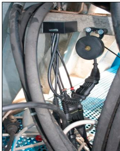
Figure 5. Microprocessor and beeper.

When the sensor no longer detects the metal surface on the drum for a time less than or equal to 6 seconds, the system activates the blinking and deactivates the output to release the movement of the mechanical organs by stopping its movement as a function of the motion detection by the sensor mounted on the tractor PTO (Figure 6). Consequently, the microprocessor determines the disengagement of the multidisc clutch as a result of the internal pressure loss of the decoupler generated by the electric pump and thus allows decoupling transmission to the manure spreader that stops while the tractor PTO continues to be active.