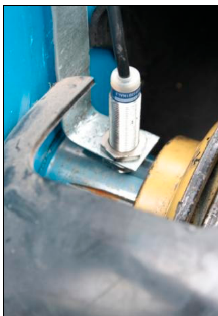
Figure 6. Sensor on PTO.

In order to prevent the motion transmission in case of failure in connecting to the 12 V power supply, the used clutch is of the “normally open” type.