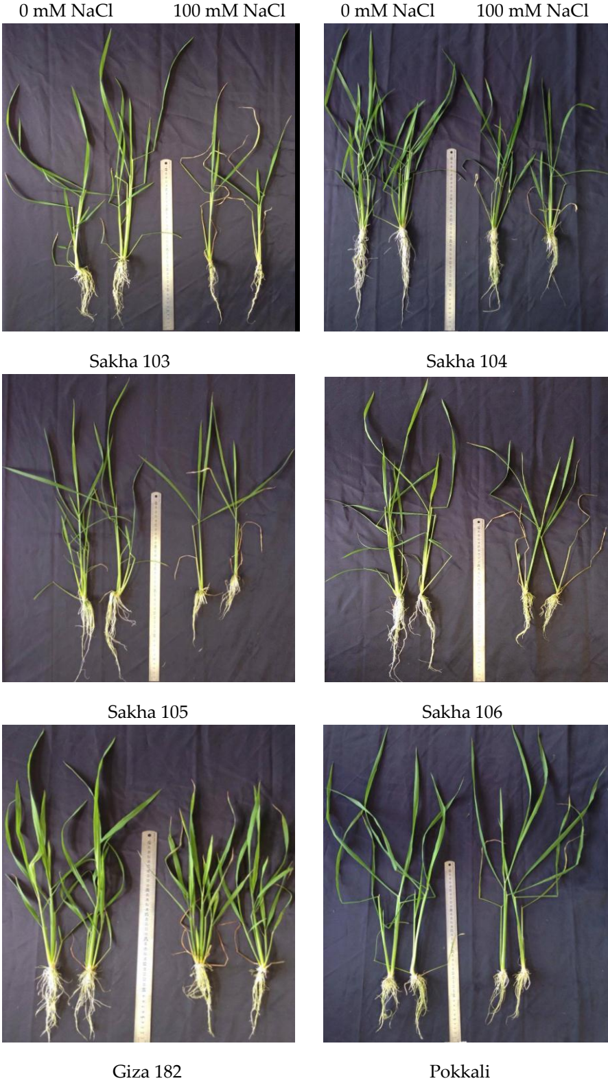
Figure S1. Visual symptoms of salt injury of different rice varieties after 14 day treatment.