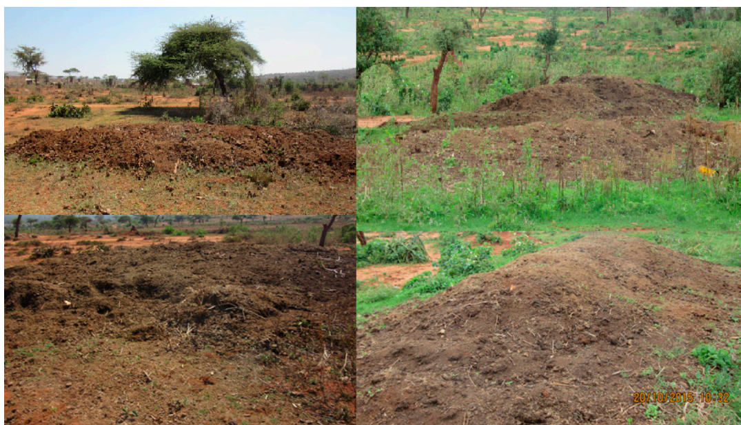
Figure 4. Representative pictures showing cattle manure heaps (dunghills) in Borana, southern Ethiopia.