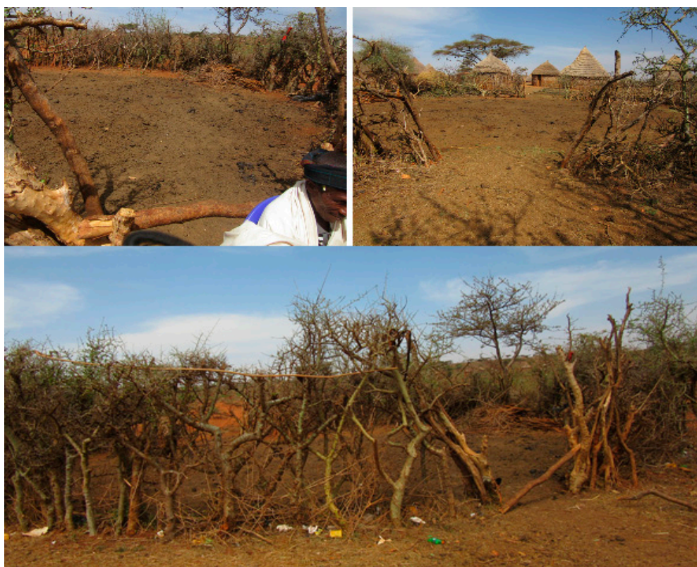
Figure 2. Large cattle kraal (locally called monna) in Borana, southern Ethiopia.

No statistical analyses were performed as all the respondents had similar responses (no variation observed) to the questions asked about manure management and housing. Therefore, the results are presented in a descriptive form using figures for illustration. Animals in the study area were freely grazing during daytime (10–11 hours) and were corralled at night in a house or kraals (locally called "monaa"). Every Borana household had livestock kraals and manure heaping sites at the edge of the household's compound. All the studied households had separate kraals for large cattle (Figure 2), mature sheep and goats (Figure 3c), calves (Figure 3d) and for lambs and goat kids (roofed and constructed 30–50 cm high above the ground) (Figure 3a,b, respectively).