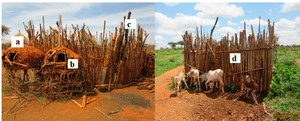
Figure 3. Kraal for goat kids (a) and lambs (b), matured sheep and goats (c) and calves (d) in Borana, southern Ethiopia.

The composition of this salt was found to be 41% NaCl with minor quantities of macro and trace minerals [1]. We visually observed that manure was swept from the kraal and heaped in an open-air site (Figure 4) located outside the kraal. The studied households were observed to use their bare hands to remove manure accumulated in the kraal; cattle hide was used to throw manure onto the heap. None of the studied households had a defined time or number of intervals per week to collect and remove manure from their kraal. Rather, the amount of manure accumulating in the kraal determined when the manure was to be swept from the kraal – usually done daily or up to every fifth day. While manure sweeping is women’s duty, men are responsible for building and repairing kraals.