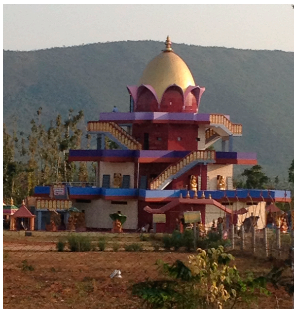
Figure 2. Sahasrakshi Meru temple, Devipuram.