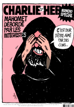
Figure 3. The Tears of the Prophet.