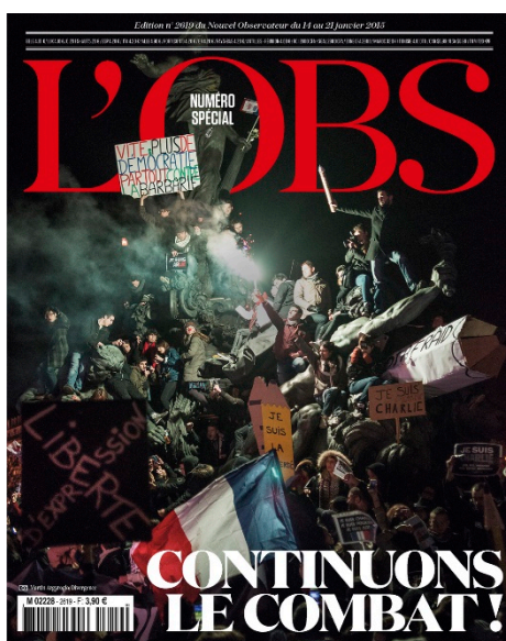
Figure 1. “Marianne Crayon”.