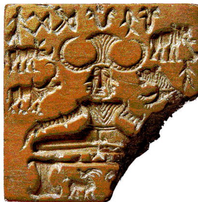
Figure 2. Paśupati seal (c. 2350 BCE): Harappan work depicting a theriomorphic priest in a yogic position and surrounded by animals. Seal #420, National Museum, New Delhi (free copyright). It is thought to be among the earliest evidence of yogic–ascetic practice in India.

There are several reasons to believe that the theriomorphic figures depicted on various seals of the Indus Valley Civilization had something to do not only with ascetic and protopathic practice (as in the famous case depicted in Figure 2), but also with medicine. As Zysk states: “[t]he elaborate headdress, the costume with bangles and the implication of trance states achieved through the intense concentration or meditation of yoga suggest that this figure depicts a type of medicine-man, shamanistic in character” (Zysk 1993, p. 3).