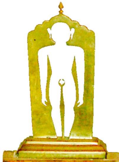
Figure 6. Jain representation of a siddhi —a liberated ( mokṣa ) being.

from these bodily limitations—cannot be represented, except by using the metaphor of a “presence through an absence”.