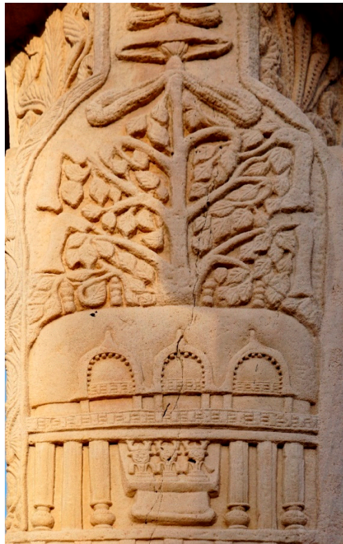
Figure 7.