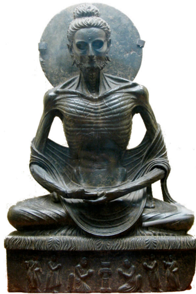
Figure 4. The Buddha as the body of the ascetic. The signs of the austere practice of renunciation are clearly visible in a body mortified by extreme asceticism. Lahore Museum PB-94.

The division or subdivision of the body in the old Vedic literature was not meant for medical purposes, but rather for ritual and sacrificial intents: “it is driven by structural imperatives such as the existence of thirty-six celestial worlds. [. . .] The point is to draw a magical, or at least symbolic, homology between the victim, the officiants, the divinities, and even the world at large” (Wujastyk 2009, p. 194). Indeed, it is commonly accepted that Vedic anatomic knowledge was quite poor (Zysk 1991, p. 16).