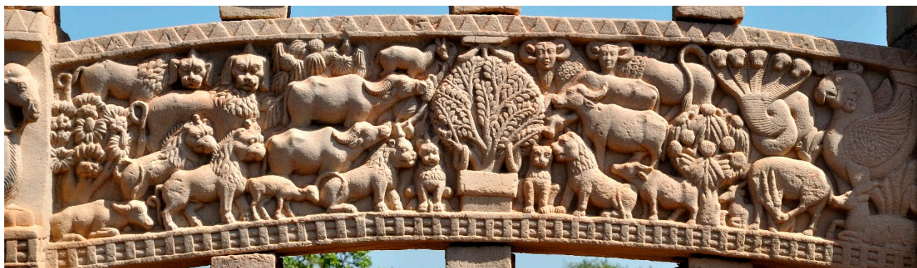
Figure 3. Multitude of animals gathered around the Buddha, represented as a Bodhi tree, in the classic style of ancient Buddhist aniconism. Sāṃcī nagara, Madhya Pradesh.