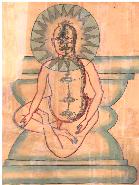
Figure 5. The yogic body understood as a set of superimposed bodies—material and spiritual bodies that coexist and interconnect, showing the “subtle body” ( liṅga-sarīra ) and “material body” ( sthūla-sarīra ). Representation of 1880 (treatise on Vedantic Raj Yoga Philosophy. Edited by Siris Chandra Basu, Student, Government College. Publisher: Lahore “Civil and Military Gazette” Press. Śrī Sabhāpati Swami, courtesy of Kurt Leland and the Theosophical Library at Adyar, public domain work.

In the ascetic traditions of India, the body is represented through metaphors of absence and presence (Figure 5). For example, in the Jain tradition, the saint one, who has reached perfection, cannot be described in any linguistic terms: “any adjective is inappropriate and inadequate” (Wujastyk 2009, p. 197). Nonetheless, we can speak of them. This is possible due to the apophatic tool: “by describing what he is not” ( idibem ). This particular condition is represented in visual art, where the body of the ascetic is represented with the same principles of illusory contours, like a Kanizsa triangle.