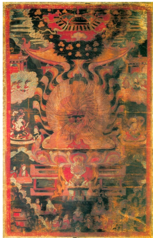
Figure 8. Private collection: item number 31838, Himalayan Art Resources, public domain work.