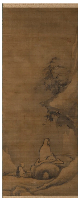
Figure 11. Bodhidharma Meditating Facing a Cliff Song Dynasty, 116.5 × 46.4 cm (painting only), The Cleveland Museum of Art, Cleveland, image cited from: https://www.clevelandart.org/art/1972.41#imageonly (accessed on 4 November 2023).

within the section of the Jāmi' al-Tavārikh: History of the Jews , the rocks of the bed are depicted dramatically to suit the demands of the painters, stressing the significance of Moses. Similarly, in Muhammad Conversing with Abu Bakr on Their Way to Medina (Or.Ms.20 f. 57r) in the Jāmi' al-Tavārikh: History of the Prophets , the painters located Muhammad next to the rocks/mountains. These paintings unveil that this period marked a transition in the incorporation of the saints and rocks/mountains combination, showcasing a feature newly adopted from Chinese figure paintings. After the 1314–1315 Jāmi' al-Tavārikh , this combination gradually became a convention. In the Jāmi' al-Tavārikh of 1425, for instance, a substantial rock stands behind the Prophet Muhammad in Prophet Muhammad Receiving First Revelation (Figure 15). Beyond the Jāmi' al-Tavārikh , similar associations between saints and rocks/mountains appear in other works. In Nezāmī's Khamsa: Iskandarnāma , Iskandar is depicted in a mountain cave when visiting a Sufi saint. Additionally, in Khamsa: Leylī and Majnūn , when Majnūn lives in the wilderness and practices asceticism like a Sufi saint, painters also tend to put him on a rock.