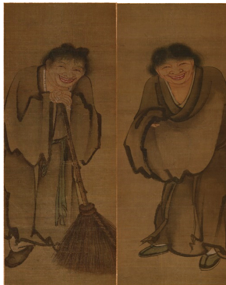
Figure 2. Two Saints of Harmony 14th century, Tokyo National Museum, Tokyo, image cited from: https://colbase.nich.go.jp/collection_items/tnm/TA-148?locale=en (accessed on 4 November 2023) © ColBase ( https://colbase.nich.go.jp/ ).