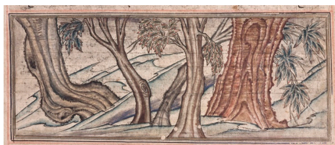
Figure 4. Maitreya's Enlightenment 1314–1315, 12 × 14 cm, Khalili Collection of Islamic Art, London, image cited from: https://www.khalilicollections.org/collections/islamic-art/khalili-collection-islamic-art-the-jami-al-tawarikh-of-rashid-al-din-mss727-folio-36b/ (accessed on 4 November 2023) © Khalili Collection of Islamic Art.

In Persian paintings, the function of the landscape is to provide a context or setting for narrating stories (Soucek 1980, p. 86). Nasrin Dastan, an Iranian painter and scholar, posits that Iranian painters do not perceive nature as an entity independent of human feelings and emotions (Dastan 2022, p. 35). This perspective explains why Persian paintings rarely feature landscapes devoid of figures. Nevertheless, two landscape paintings in the Jāmi al-Tawārīkh of 1314–1315 broke this convention, potentially influenced by the abundance of shanshui paintings from China. This influence prompted Persian painters to embrace this theme. According to the research of Toh Sugimura, a scholar investigating Persian muraqqa's in the library of the Topkapı Palace Museum, the themes of Chinese paintings in the muraqqa's primarily fall into four categories: figures, shanshui, flowers and birds, and animals. Although shanshui paintings are relatively scarce, it is discernible which type captured the attention of Persian painters. For instance, in an imitation by Persian painters known as Autumn Scenery (Figure 5), the entire landscape comprises mountains, water streams, and trees. These three elements signify a shift in the background components of Persian paintings since the early 14th century.