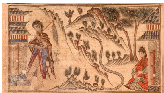
Figure 7. The Mountains between India and Tibet 1314–1315, Khalili Collection of Islamic Art, London, image cited from: (Blair 1995, p. 77, figure 42).