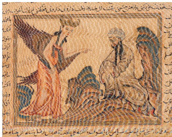
Figure 10. Prophet Muhammad Receiving First Revelation 1314–1315, University of Edinburgh, Edinburgh, image cited from: https://images.is.ed.ac.uk/luna/servlet/media/book/showBook/UoEsha-4-4-64742~103064 (accessed on 4 November 2023)