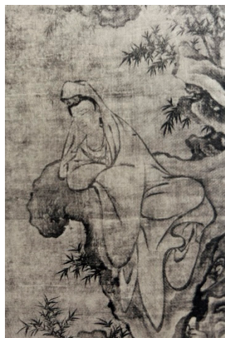
Figure 13. The Painting of Guanyin Southern Song , 154.5 × 93.7 cm, Enkaku-ji, Okinawa, image cited from: (Li 2021, p. 66, figure 3-a).