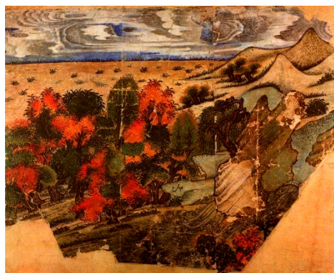
Figure 5. Autumn Scenery c. 1300–50, Topkapı Palace Museum, Istanbul, image cited from: (Kadoi 2009, p. 220, figure 6.12).

produced in 1290, and Ibn Bakhtīshū's Manāfi-i Hayavān ( The Benefits of Animals ) from the Morgan Library and Museum (M. 500), illustrated around 1300, exhibit plain and lifeless backgrounds. In contrast to Persian painting, Chinese painting designates a specific category for landscapes—shanshui painting. The proliferation of shanshui paintings significantly increased with the advent of Zen Buddhism and the participation of scholar-officials and literati, imbuing it with deeper connotations and important aesthetic value. Unlike human figures, plants, and animals, shanshui serves as a distinctive feature in Zen paintings. Zen painters employ implicit suggestions rather than direct depictions in shanshui paintings, encouraging viewers to construct the entire picture through comprehension and imagination (Cahill 2018, p. 106).