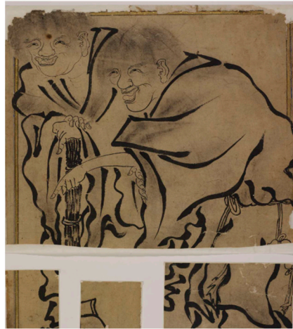
Figure 1. Two Saints of Harmony c. 1400–1500, 30 × 36.1 cm, Staatsbibliothek zu Berlin, Berlin, image cited from: https://digital.staatsbibliothek-berlin.de/werkansicht?PPN=PPN73601389X&PHYSID=PHYS_0133&view=overview-toc&DMDID=DMDLOG_0133 (accessed on 4 November 2023) © STAATSBIBLIOTHEK ZU BERLIN Preussischer Kulturbesitz, Orientabteilung.

the preferences of Persian painting. In Persian painting, characters are regarded as the center of the paintings, while landscapes, plants, and animals serve merely as decorative elements. Consequently, other commonly seen Chinese Zen painting themes, for instance, landscapes, have not been imitated like portraits of free spirit Zen saints, but this does not mean that landscape painting has not entered Iran or not attracted the attention of Persian painters. Its distinctive brushwork and unique atmosphere must have affected Persian painters, thus making some illustrations in Jāmi' al-Tavārikh evocative of Zen aesthetics.