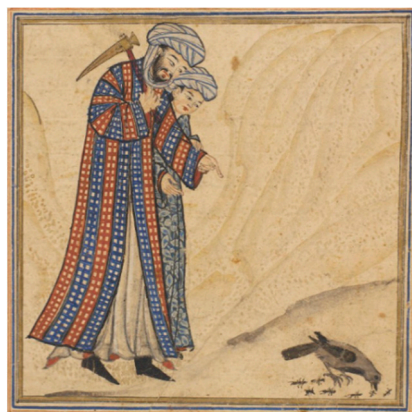
Figure 8. Discovery of the Well Zamzam 1314–1315, University of Edinburgh, Edinburgh, image cited from: https://images.is.ed.ac.uk/luna/servlet/detail/UoEsha~4~4~64742~103064?qvq=q:rashid&mi=0&trs=399 (accessed on 4 November 2023) © Heritage Collections, University of Edinburgh.

Persian painters possessed a distinct advantage in emulating Chinese painting, primarily owing to their use of the same brush. This facilitates the mastery of brushwork ranging from gongbi 工筆 (meticulous painting) to xieyi 寫意 (freehand brushwork) by Persian painters. The prevalence of imitations of gongbi paintings, particularly those featuring flowers, birds, and figures in the muraqqa’s, underscores Persian painters’ preference for this delicate and skillful painting style. In contrast, xieyi painting, characterized by a different aesthetic, is less common in Persian painting, appearing sporadically in specific elements of individual paintings, such as the depiction of Hanshan and Shide’s hair in Two Saints of Harmony (Figure 1) and light ink mountains in Discovery of the Well Zamzam (Figure 8). As mentioned in the previous section, Persian painters noticed the significance of mountains in the paintings. While incorporating this theme from Chinese painting, they retained a Persian manner in the details. For instance, in The Mountains of India (Figure 3), the outlines of the mountains are thick, and the colors are heavy. A similar stylistic ap-