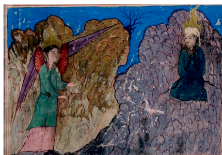
Figure 15. Prophet Muhammad Receiving First Revelation c. 1425, 15.5 × 22.2 cm (painting only), Metropolitan Museum of Art, New York, image cited from: https://www.metmuseum.org/art/collection/search/451418 (accessed on 4 November 2023).