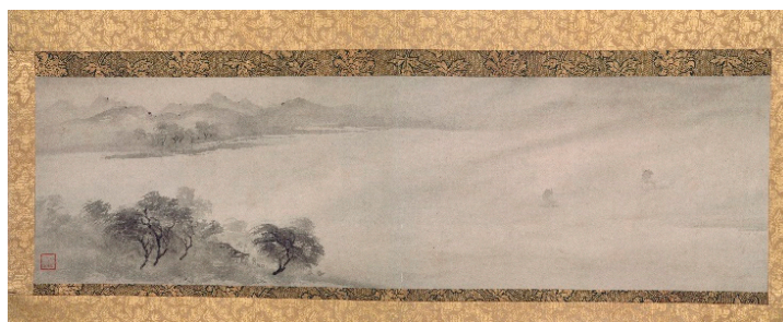
Figure 6. Returning Sails off the Distant Shore Southern Song, 32.5 × 112.3 cm, Kyoto National Museum, Kyoto, image cited from: http://www.ltfc.net/view/SUHA/6089880533ad8750e9a6c25d (accessed on 12 December 2023).