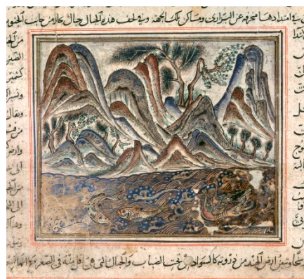
Figure 3. The Mountains of India 1314–1315, 12 × 14 cm, Khalili Collection of Islamic Art, London, image cited from: https://www.khalilicollections.org/collections/islamic-art/khalili-collection-islamic-art-the-jami-al-tawarikh-of-rashid-al-din-mss727-folio-21a/ (accessed on 4 November 2023) © Khalili Collection of Islamic Art.

paintings (Inal 1975). The shanshui theme painters' choice to depict related text is another influence of Chinese art.