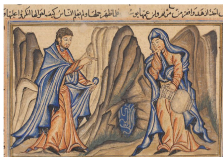
Figure 9. The Annunciation 1314–1315, University of Edinburgh, Edinburgh, image cited from: https://images.is.ed.ac.uk/luna/servlet/detail/UoEsha~4~4~64742~103064?qvq=q:rashid&mi=0&trs=399 (accessed on 4 November 2023) © Heritage Collections, University of Edinburgh.

proach is evident in The Annunciation (Or.MS.20, f. 22r, Figure 9), where the mountains, drawn with thick outlines, assume a prominence akin to the two central figures. Richard Ettinghausen points out that Persian paintings, while imitating Chinese paintings, lack a sense of reality and space, attributing this deficiency to the painters' unfamiliarity with the artistic and visual principles of Chinese shanshui paintings (Ettinghausen 1979b, p. 247). However, in Discovery of the Well Zamzam , the mountains painted in light ink perfectly bear the responsibility of background. They fulfill the obligation of decorating the blank space, providing the painting with a sense of depth to accentuate the central figures. An intriguing detail in the painting is a partially completed black line on the left side, prompting speculation that the painter initially intended to use heavy outlines for the mountains, as seen in The Annunciation . Nevertheless, influenced by shanshui paintings, the painters departed from tradition and opted for a light ink brushwork approach.