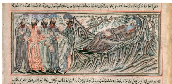
Figure 14. The Death of Moses on Mountain Nebo 1314–1315, 11 × 25.5 cm, Khalili Collection of Islamic Art, London, image cited from: https://www.khalilicollections.org/collections/islamic-art/khalili-collection-islamic-art-the-jami-al-tawarikh-of-rashid-al-din-mss727-folio-54a/ (accessed on 4 November 2023) © Khalili Collection of Islamic Art.