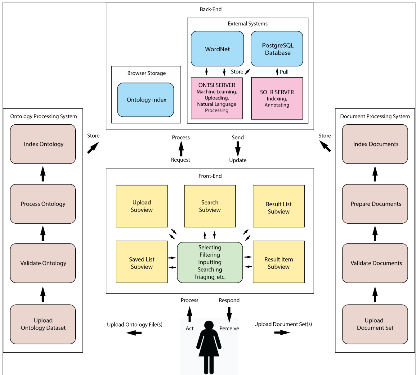
Figure 4. Depiction of the functional workflow of ONTSI. Labelled arrows reflect the steps of the interaction loop. Brown boxes represent the processes performed within the back-end computation systems. Blue boxes represent the object types that persist within the browser and external index database storage. Pink boxes represent the back-end computational systems of ONTSI. Yellow boxes represent the various subviews within the front end of ONTSI. The green box represents the types of interactions that can be conducted with the system.

query term is depicted with the text of the term and a removal interaction, represented by a trailing “x” button. If multiple terms require removal, this can be done either with individual removal actions, repeated backspacing actions from the keyboard, or the red “trash can” button, which clears all query terms.