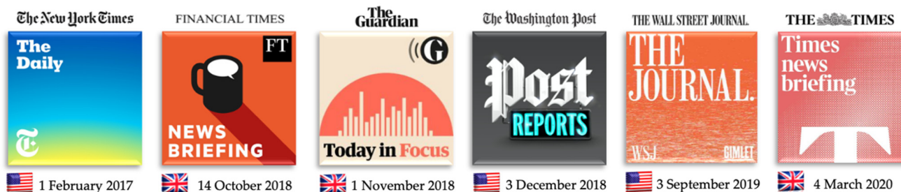
Figure 1. Daily podcasts produced currently by the most important newspapers in the USA and UK.

media have also adopted: radio (NPR, iHeartRadio, and BBC), television (CNN, ABC, and NBC), and the Internet (Vox and Axios).