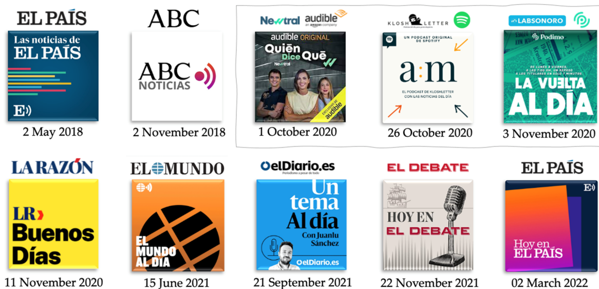
Figure 2. News podcasts of Spanish newspapers and audio platforms.