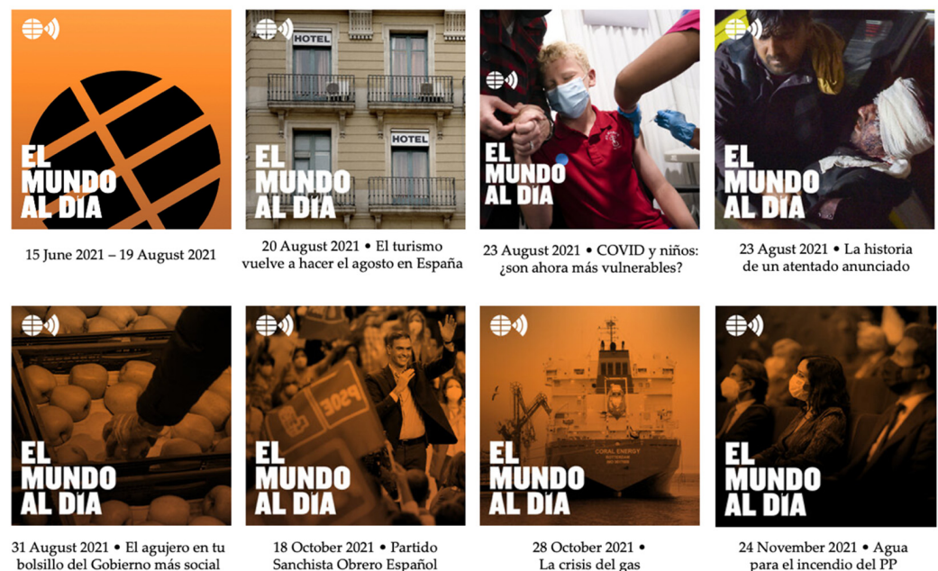
Figure 3. Evolution of the visual aesthetic of the covers of 'El Mundo al día'.

Its visual identity is striking, as in its initial phase (15 June to 19 September 2021) it was identified by a logo and intense corporate tone (dark orange); however, since the 20th of August 2021, the logo has been superimposed on an image in colour that aims to sum up the issue in question; this additional change would be adjusted a few days later, with the episode 'The hole in your pocket made by the most socially engaged Government' (31 August 2021); from then on, 'El Mundo al día' redefined its graphic appearance, which is now based on an image that refers to the news story in question treated with a filter with the same tone and the name of the podcast superimposed in white (Figure 3).