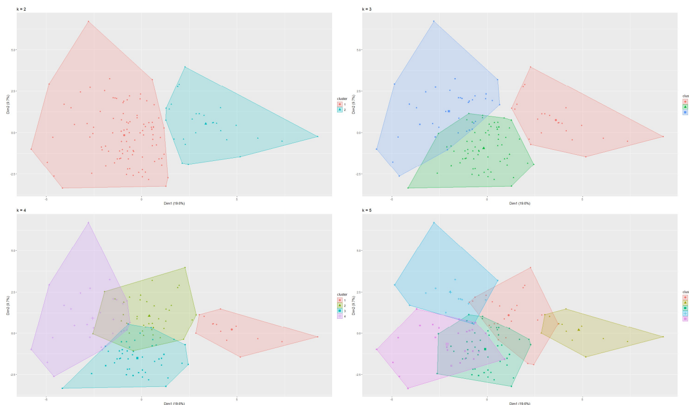
Figure 3. Students' clusters by k-means ( k = 2, 3, 4, 5 ).

The first cluster consists of 103 “satisfied” students—with higher ratings on student intention to use AI chatbots (Question #6) and greater benefits from their usage (Question #8) (Table A.2). In contrast, the students from the second cluster (28 students) demonstrate lower satisfaction in generative AI technologies. Differences between students from the two clusters are insignificant in terms of knowledge (Question #5) and concerns about AI chatbot applications (Question #7). In Table A.2, the average estimates of indicators for two clusters, as well as the differences between these estimates, are depicted [63].