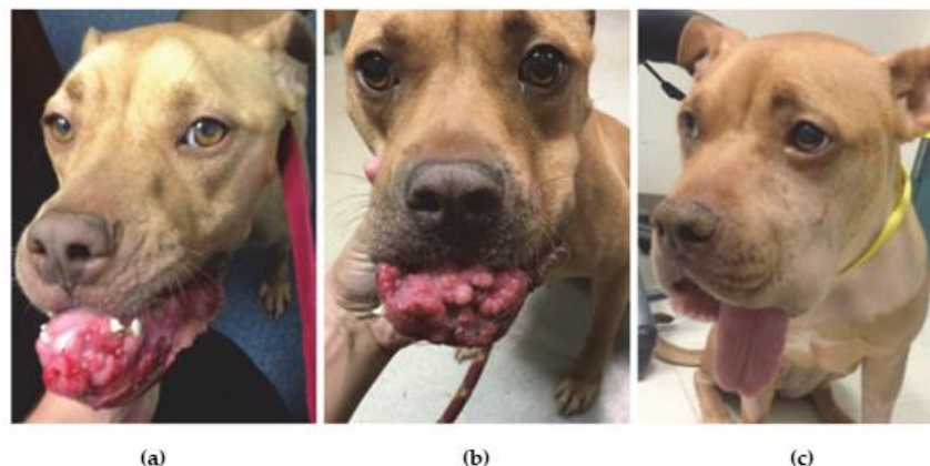
Figure 3. A dog with an inoperable oral squamous cell carcinoma with metastases in regional lymph nodes: (a) before the administration of HylaPlat; (b) after the second injection; (c) at the fourth injection of the formulation. Reproduced by [97].

promoted the localization of cisplatin within the metastatic lymph nodes [98]. The dog reached a complete remission and maintained a stable condition for at least one year after the treatment (Figure 3) [97].