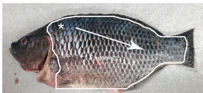
Figure S1. Schematic of tilapia skin preparation. The skin was cut along the solid lines and then pulled in the direction of the arrow from the dorso-cranial corner (*). The procedure was repeated on opposite side.

* Correspondence: vapniarsky@ucdavis.edu