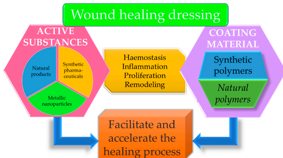
Figure 2. Schematic representation of a wound management process.

Choosing a proper coating material in which an active substance can be incorporated conduct to a successful wound management, thus facilitating and accelerating the healing process (Figure 2). An ideal material must be safe, non-irritant, easy to apply, pain-free, cost-effective and highly absorbent [43].