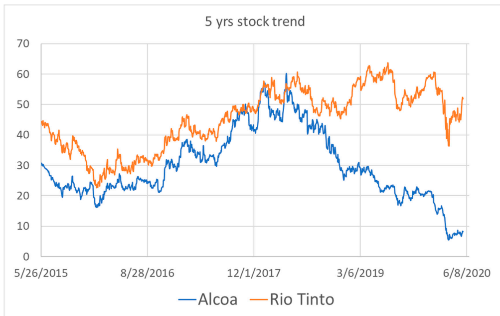
Figure 3. Historical stock prices of Alcoa and Rio Tinto [60,61].