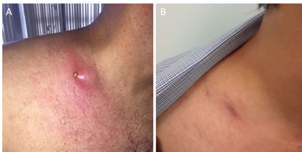
Figure 1. Cont.

Keywords: lymphadenitis; Cryptococcus neoformans ; immune reconstitution; HIV