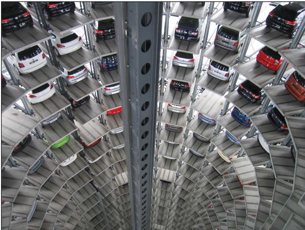
Figure 4. An exemplar parking space complex for autonomous vehicles, 2019.

(or in activity centers) and declines away from these destinations. Hence, it is most likely that parking facilities will be outside the urban core in distributed locations, and they will include daytime or overnight charging facilities at the parking lots. Depending on the location and business models, some of these parking facilities might be in the form of the multi-level parking as in Figure 4. As a result, the requirements to provide obligatory parking spaces in these high-value property areas will need a re-estimation [60]. Reduction in parking lots will transform inner-city areas, as unoccupied parking space will be used for other activities—such as parks or affordable housing. This transformation will allow further realization of mixed-use precincts to trigger the trend of downtown living, creating inner-city areas that are more functional and livable. Meanwhile, some AV charging lots in and out of the city might also be used as mobile office locations. On the other hand, there also exists a pessimistic perspective. Highlighted in a review by Stead and Vaddadi [57], “parking policies will remain as they are (i.e., AVs will use on-road parking spaces). A growth in AV ownership and use leads to an increase in demand for parking spaces in the city. Large numbers of collection/drop-off points are created in the city which add to the amount of space allocated for vehicles” (p. 126).