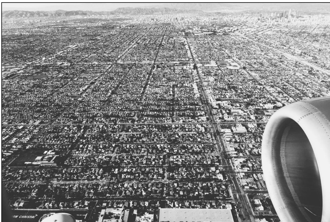
Figure 5. Sprawling development of Los Angeles, 2019.

General Decline of Settlement Densities and Increasing Urban Sprawl: AVs have the natural potential to create an induced urban sprawl—in other words, growth of low-density suburbs (Figure 5). AVs could trigger travel demand (necessary or not) particularly in high motor vehicle dependent societies [69]. They can result in more dispersed and fragmented land uses in the outskirts of cities [70]. This can occur when travel that is more effortless is seen as less of a burden and an invitation to travel more—unless legislators and planners act now. Optimization of accessibility of communities through better land use provision or allocation is required to discourage sprawl.