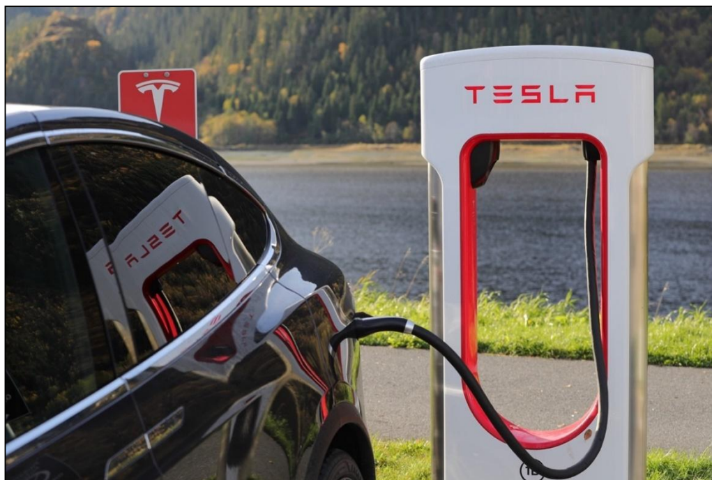
Figure 3. An electric autonomous vehicle charging, 2019.

AVs include automobiles, trucks, drones, ferries, and ships that are driverless or self-driving. Autonomous mobility has evolved incrementally over decades employing many different technologies for steering, navigation, collision avoidance, and maneuvering that will culminate in fully autonomous systems in the next few years. Some elements of AVs have been in use for many years while others are just entering the market. A further implication of the introduction of AVs depends on the power source used, with many AVs being electric (Figure 3) rather than gasoline/diesel, so a shift to AVs may also herald a shift in vehicle energy sources [44]. When summed, however, the set of technologies offers the potential for a vehicle to move and navigate through traffic with no driver assistance.