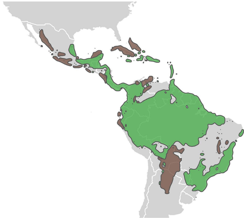
Figure 1. The distribution of neotropical dry (brown) and rainforests (green) suggests that ecotones should occur across thousands of kilometers across Mexico, Costa Rica, Colombia, Bolivia, Brazil, and smaller regions throughout. Ecoregion classifications were based on Olson et al. [80] for tropical and subtropical dry and moist broadleaf forests.