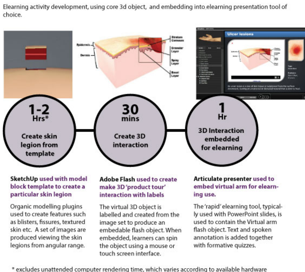
Figure 2. Skin legions activity created and embedded using presentation tool.

Prior to using the “virtual arm”, clear and concise instructions for using the presentation were provided. To ensure students had the opportunity to assess their learning they were provided with appropriate feedback and a quiz evolved including “fun” tasks such as a sequence, spell and visual test. If a student achieved a correct answer they were immediately “rewarded” with a “round of applause”. The students score was still provided at the end of the quiz together with the pass rate of 80%.