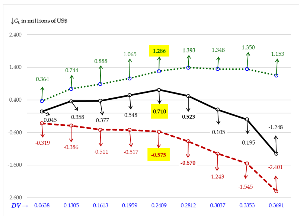
Figure 1. Nongrowth Pass-Through Gain to Leverage ( G_L ) Versus debt-to-firm value ratios ( DVs ) under Tax Cuts and Job Acts (TCJA) with g_L of 0% and optimal credit rating (OCR) of A3. Gain to Leverage ( G_L ), solid line; 1st Component, dotted line, and 2nd Component, dashed line.

This section provides three PT figures. Somewhat similar figures for CCs can be found in Hull (2020). Figure 1 plots the gain to leverage ( G_L ) and its two components against debt-to-firm value ratios ( DVs ) under TCJA when there is nongrowth. Figure 2 repeats Figure 1 but replaces the nongrowth values with growth values using the historical growth rate of 3.12%. Figure 3 plots firm value ( V_L ) against credit ratings for the TCJA nongrowth test and the three TCJA growth tests. As first described in Section 1, these three growth tests involve growth rates of 3.12%, 3.90%, and 4.50%. Figure 3 only considers the feasible P choices for growth tests causing the three growth trajectories to have different plot points. Unfeasible choices are not possible due to violation of the growth constraint. Whereas growth trajectories only consider feasible points, the nongrowth trajectory is truncated in that all of its feasible points are not shown.