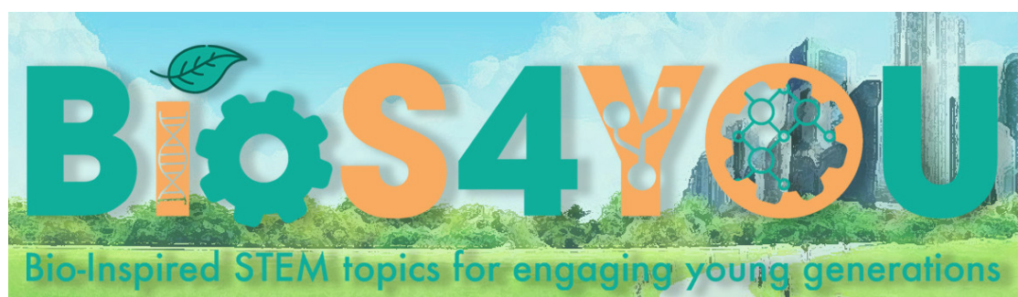
Figure 2. Logos of the BioS4You project.

The specific results and impact for students are: