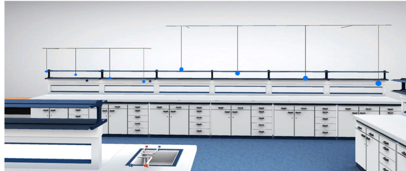
Figure 1. The virtual laboratory environment of the pendulum lab exercise. There are 10 pendulums of different lengths (8 are shown in this screenshot with blue color) that can be deflected to observe their motion.

To accurately simulate the motion of the pendulum, the time constant \tau was estimated. The process of estimating the time constant \tau involved several steps. First, the video of the real pendulum motion was captured and analyzed using the Tracker software (ver. 6.3.1) [53]. The Tracker software is a video analysis software that is used to analyze the motion of objects captured in video and to extract various kinematical variables, such as the position, speed, and acceleration of an object as a function of time. In our case, the software was used to record the deflection angle as a function of time for various pendulums with different lengths.