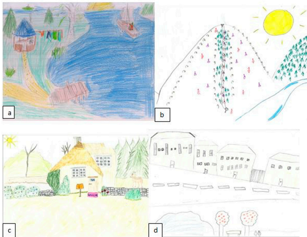
Figure 2. Drawn landscapes as an experienced place (analysis phases II and III): (a) lakeside summer cottage drawn by a Finnish boy (11 years) (b) downhill skiing drawn by a Finnish girl (15 years) (c) classical country landscape drawn by a Swedish girl (12 years) (d) town experiences drawn by a Swedish boy (15 years).