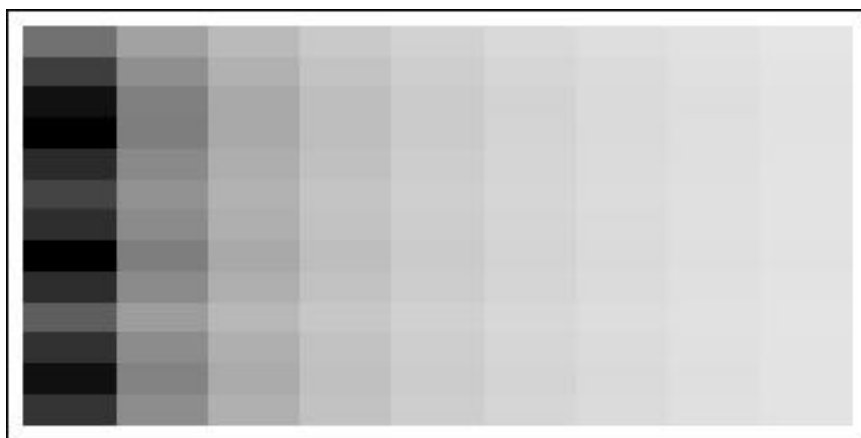
Figure 1. From left to right are displayed, in gray-scale output, the values of function (50) for n = 2, \dots, 10 , and from top to bottom its arguments are: \pi_n^{(0,0)} , \pi_n^{(1,1)} for \rho = 2 , \pi_n^{(2,1)} for \rho = 4 , \pi_n^{(3,1)} for \rho = 913 , \pi_n^{(4,1)} for \rho = 23 , \pi_n^{(1,2)} for \vartheta = 2 , \pi_n^{(2,2)} for \vartheta = 784 , \pi_n^{(3,2)} for \vartheta = 93 , \pi_n^{(4,2)} for \vartheta = 57 , \pi_n^{(1,3)} for v = \chi = \psi = 1 , \pi_n^{(2,3)} for v = 49 , \chi = 891 , \psi = 97 , \pi_n^{(3,3)} for v = 413 , \chi = 732 , \psi = 231 , and \pi_n^{(4,3)} for v = 713 , \chi = 3427 , \psi = 231 . For n = 10 (last column), a high level of coincidence between all rational approximants was already observed.

ranges from 0.0144346... to 0.137009... The values close to the minimum of (50) are shown as white squares while its maxima are shown as dark squares. Indeed, ten iterations (see columns in Figure 1) are enough to show the accuracy of our results in the approximation to \zeta(3) . Clearly, in Figure 1 the darkness decreases as the number of iterations grows, which is in accordance with the analytical results on the asymptotic behavior of the remainders discussed in Section 4. In addition, in Tables 1 and 2, we compare the rates of convergence of four selected cases among infinitely many options of the studied holonomic rational approximants versus \pi_n^{(0,0)} ; namely, \pi_n^{(1,1)} for \rho = 2 , \pi_n^{(1,2)} for \vartheta = 2 , and \pi_n^{(1,3)} for v = \chi = \psi = 1 .