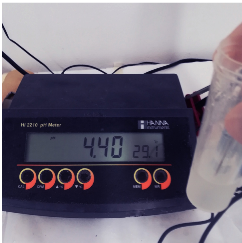
Figure S3: Measurement of the pH of a real sweat sample using a laboratory pH meter.