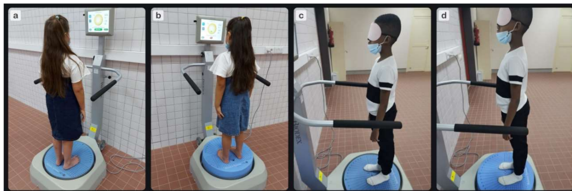
Figure 2. This is a figure for the testing procedures. (a) Eyes open/firm surface, (b) eyes open/foam, (c) eyes closed/firm surface, (d) eyes closed/foam.

used to compare the stability indices of all tested conditions: eyes open/firm surface, eyes closed/firm surface, eyes open/foam surface, and eyes closed/foam surface in both groups based on age and IQ score. If the F-ratio is significant, Tukey HSD post hoc test was used for subsequent multiple pairwise comparisons. The significance level of a p -value of \leq 0.05 was considered statistically significant using 95 percent confidence intervals.