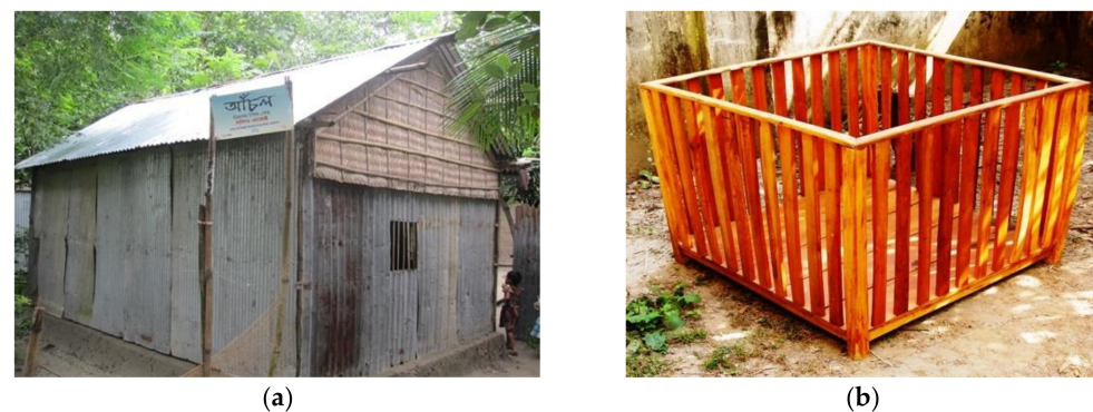
Figure 1. SOLID study interventions: (a) day-care intervention; (b) wooden playpen.

The two sub-districts were divided into two areas, with the villages in those sub-districts being randomly allocated into Area 1 or Area 2. In Area 1, playpens were initially distributed to a limited number of children while the day-cares were gradually established. Playpens were also distributed on a first-come, first-served basis to children who were eligible to receive the playpen. In Area 2, day-cares were gradually established over the entire study period while playpens were distributed on a ‘first-come first-serve’ basis after the initial period. Children in both areas had the choice of participating in either or both interventions. For the sub-study, villages under Area 1 and 2 were randomly selected to include the children enrolled in playpen-only group (in Area 1) and in the day-care-only group (in Area 2). Children enrolled in both the playpen and day-care interventions across Areas 1 and 2 were not included in the sub-study. At the time of the initial developmental assessment (considered the baseline assessment), i.e., between April and September 2015, 30 children aged 9–17 months were selected from each village until a total of 600 children was selected from each area, for a total of ~1200 children for the sub-study [10]. A follow-up assessment was conducted for the same set of ~1200 children approximately 12 months after the first assessment between April and June 2016 (Figure 2).