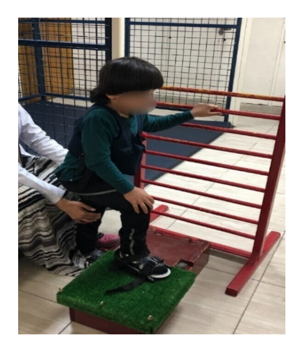
Figure 3. Forward step-up exercise.

Loaded functional strength training was carried out with resisted forward step-ups, lateral step-ups, squats, sit-to-stand, and stoop-and-recover exercises (Figure 3). The exercises were carried out in a circuit fashion. A customized weight vest was used to give resistance. The weight vest had a weight pocket bearing different loads, ranging from 0.25 to 6 kg. The weight vest's load was evenly distributed anteriorly, posteriorly, and to the sides [6]. The weights were added into the pockets of the body vests based on the individual eight-repetition maximum (8 RM) test [18], according to gross motor function classification system levels I and II. We estimated 8 RM to be around 35% and 30% of the child's total weight [4]. The load was gradually raised to match the child's strength until all tasks were practiced with a maximum of 75% of 8 RM (Table 1). Each session was initiated with a 10 min warm-up period, including stretching of the major muscles and muscle groups, and terminated with a 10 min cool-down period in the form of aerobic exercises. Both groups received their training program for 60 min with a rest interval of 2 min between different types of exercises, with a frequency of 3 days/weeks for a duration of 12 weeks.