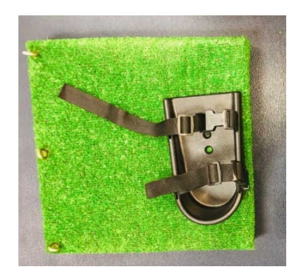
Figure 2. Shoe supporter.

Loaded functional strength training was carried out with resisted forward step-ups, lateral step-ups, squats, sit-to-stand, and stoop-and-recover exercises (Figure 3). The exercises were carried out in a circuit fashion. A customized weight vest was used to give resistance. The weight vest had a weight pocket bearing different loads, ranging from 0.25 to 6 kg. The weight vest's load was evenly distributed anteriorly, posteriorly, and to the sides [6]. The weights were added into the pockets of the body vests based on the individual eight-repetition maximum (8 RM) test [18], according to gross motor function classification system levels I and II. We estimated 8 RM to be around 35% and 30% of the child's total weight [4]. The load was gradually raised to match the child's strength until all tasks were practiced with a maximum of 75% of 8 RM (Table 1). Each session was initiated with a 10 min warm-up period, including stretching of the major muscles and muscle groups, and terminated with a 10 min cool-down period in the form of aerobic exercises. Both groups received their training program for 60 min with a rest interval of 2 min between different types of exercises, with a frequency of 3 days/weeks for a duration of 12 weeks.