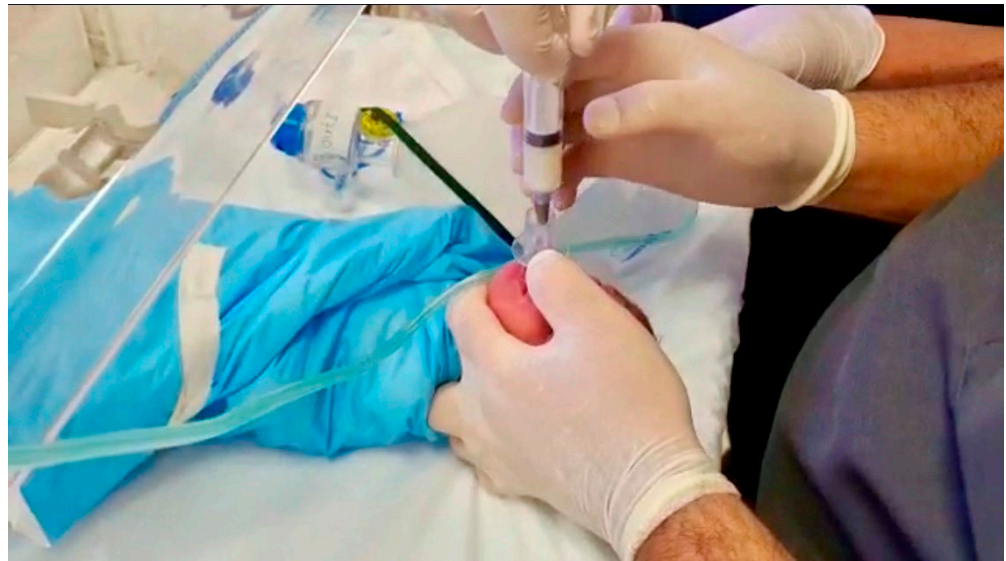
Figure 2. Master trainer using the SALSAs technique to administer surfactant to a neonate.

As part of the plan–do–study–act cycles, other faculty and resident physicians were taught and then encouraged to use SALSAs in similar clinical situations. The use of InSurE, however, was allowed to continue.