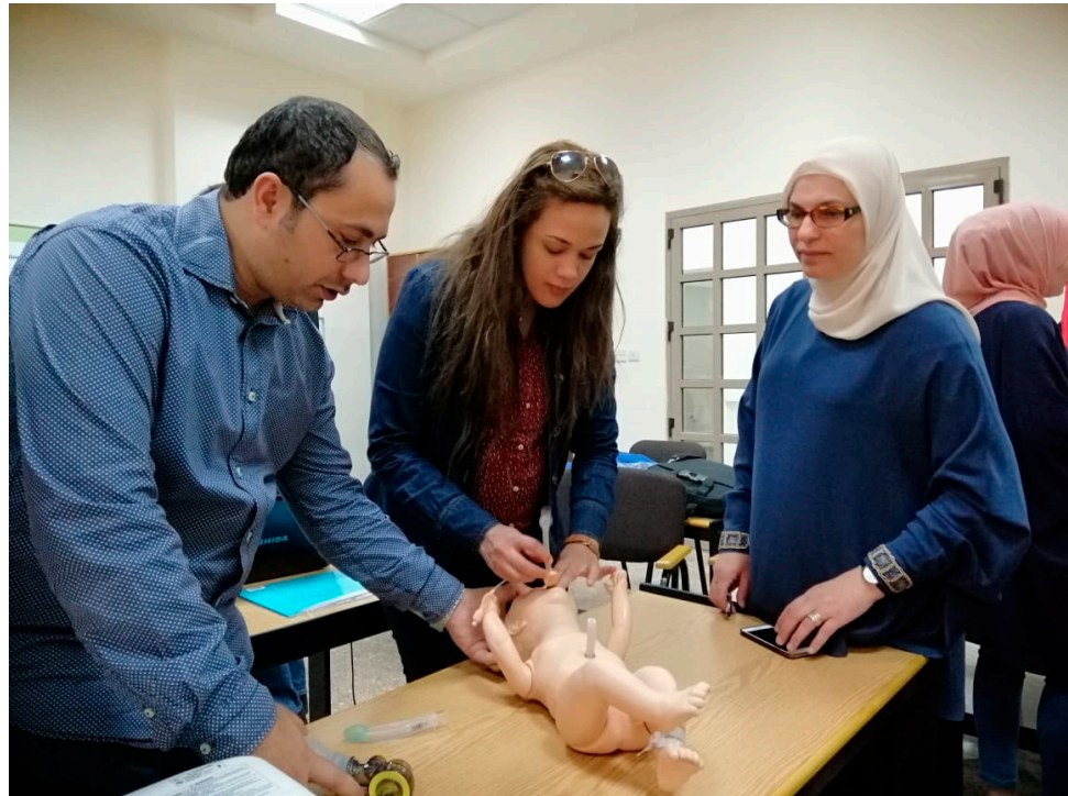
Figure 1. Al Bashir SALS workshop used to educate providers on the technique.

the use of an SAD in resuscitation and also for surfactant administration in the neonate. Educational presentations discussed device type and size, recommended use, procedural steps, and benefits over intubation. Learners were then able to practice placement of the SAD on mannequins with MT guidance. (Figure 1) Faculty and residents were encouraged to consider using the SALS technique with the right clinical situation.