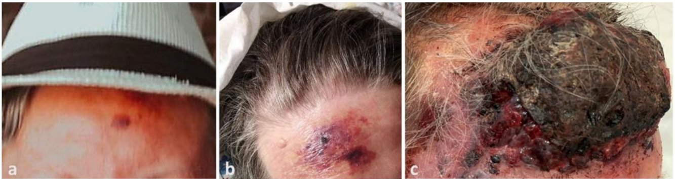
Figure 1. (a) Dramatic progression of angiosarcoma of the scalp, beginning as a small erythematous-violaceous patch on the patient's forehead three months before admission, (b) extending to a large violaceous plaque on the patient's forehead one month later, (c) and finally becoming a large, raised, necrotic and bleeding mass on the forehead with infiltrative plaques and nodules on the face three months later.