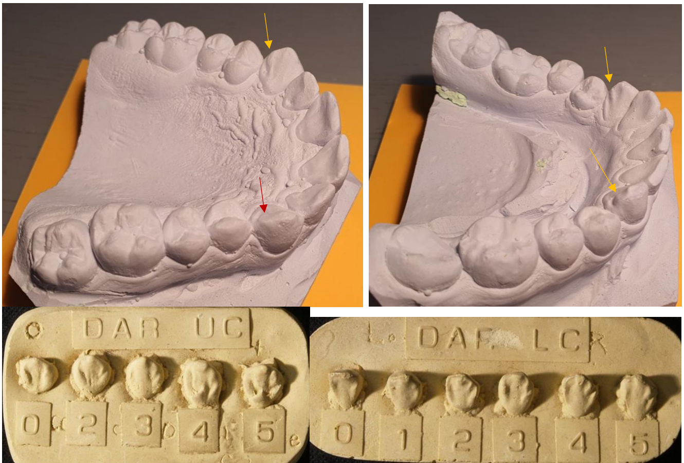
Figure 1. Case 29 with the ASUDAS referent plaques for scoring the distal accessory ridge (DAR) of the upper (plaque DAR UC) and lower canines (plaque DAR LC). In this case, the upper right canine and both lower canines were scored as grade 4 (yellow arrows). The upper left canine was not scored due to wear (red arrow).

Canines manifesting wear facets in the area of the DAR were excluded from scoring and recorded as missing data.