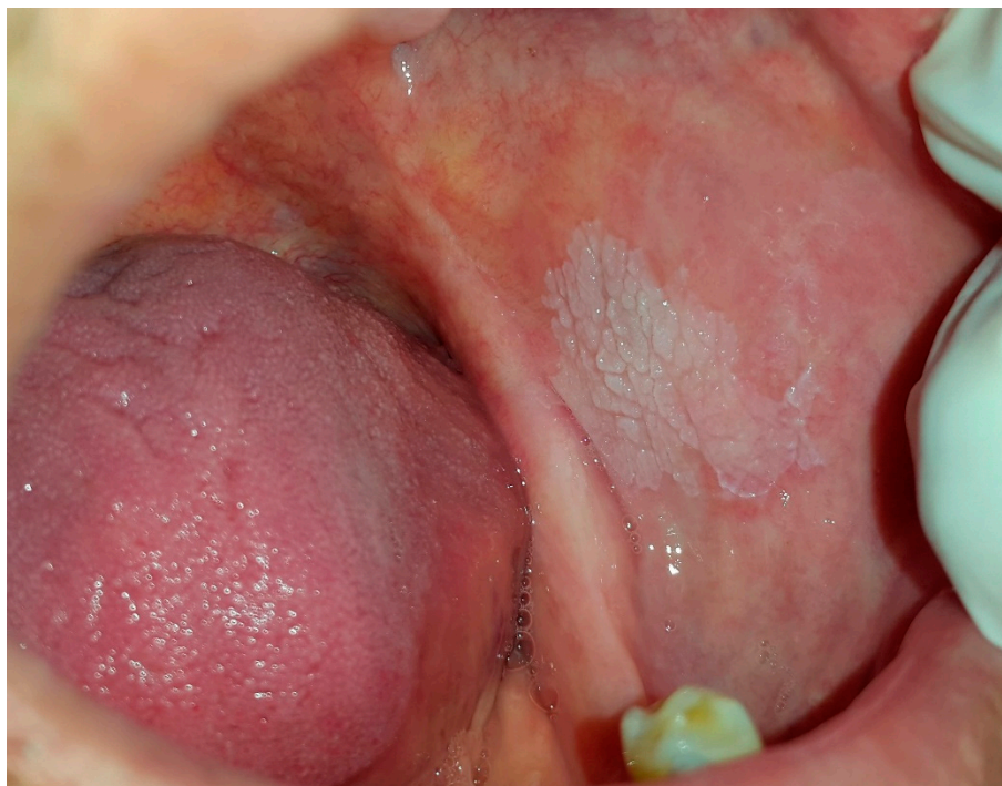
Figure 8. Leukoplakia on the buccal mucosa.