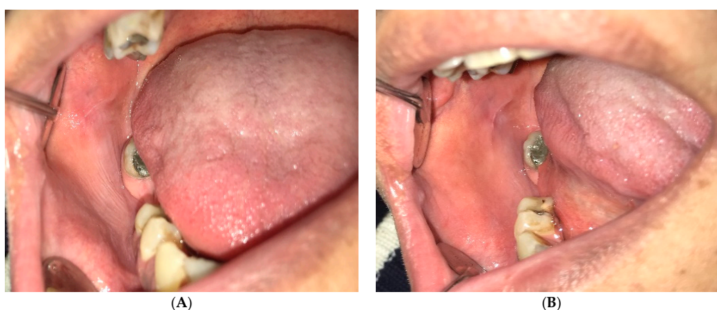
Figure 2. Leukoedema: (A) White appearance of buccal mucosa due to Leukoedema. (B) By stretching the mucosa, the white wrinkled area disappeared.

Leukoedema is a common normal variation of the oral mucosa. The prevalence has been reported up to 90% among blacks and between 10–50% in whites, with no sex predilection [4–6]. Higher prevalence among blacks is possibly due to more mucosal pigmentation making this condition more apparent [5]. It is more distinct in smokers; however, after smoking cessation, it becomes less obvious. It seems to be a developmental variation with an unknown etiology [4,5]. Clinically it presents as a diffuse, gray to white, non-scrapable and veil-like condition, which can be described as a milky and opalescent transformation of the oral mucosa. In more prominent cases, leukoedema is characterized by mucosal folds along with wrinkles or whitish streaks. This condition usually disappears temporarily after gentle stretching of the mucosa, which reappears after quitting the manipulation (Figure 2).