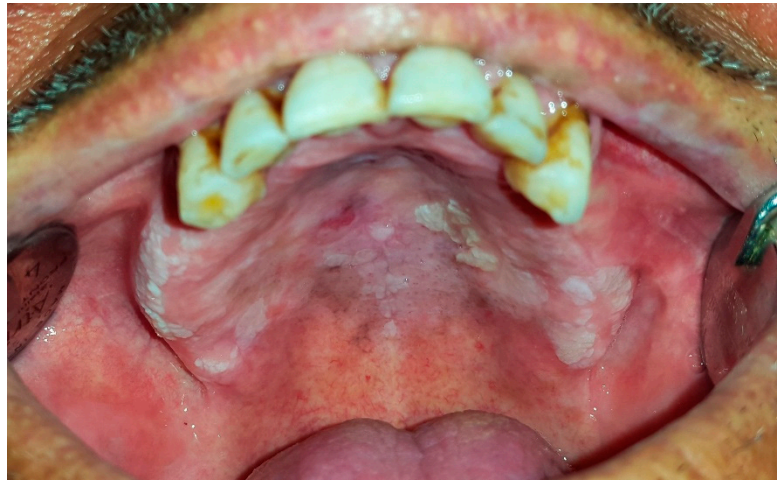
Figure 10. Proliferative verrucous leukoplakia spreading over hard palate and alveolar ridges.

Clinical appearance in the early stage contains small whitish and well-defined patches or plaques appearing as focal and homogeneous keratotic lesions (Figure 10).