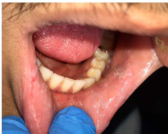
Figure 5. Habitual biting of cheeks and the lower lip.