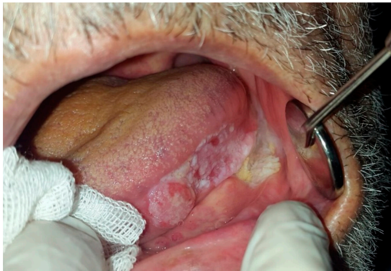
Figure 11. Squamous Cell Carcinoma with verrucous, plaque like and exophytic clinical manifestations at the lateral border of the tongue, extending to the floor of the mouth.

The lesion can be flat or elevated with some palpability or induration. The floor of the mouth, posterior lateral borders and ventral surface of the tongue are considered high-risk areas for OSCC. Involvement of submandibular and digastric lymph nodes due to cancer causes lymphadenopathy with firm to hard consistency, which converts to fixed nodes in later stages [4,5]. Patients are most often diagnosed in advanced phases after progression of symptoms related to disease. Five-year survival rate of OSCC is about 53–56% [22]. Treatment planning depends on clinical staging; therefore, primary stages are treated by surgical process and advanced cases may be managed by radiation therapy or combined chemoradiation therapy with or without surgery [5] (Table 4).