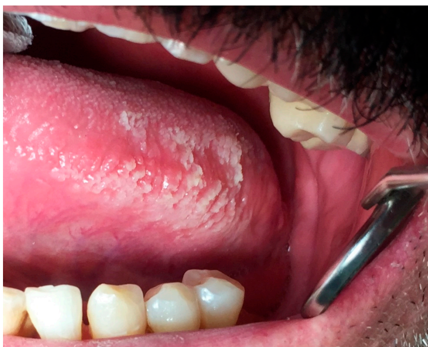
Figure 9. Oral hairy leukoplakia on the lateral border of the tongue with vertical white folds.

Oral hairy leukoplakia (OHL) is a white lesion that develops in immunosuppressed patients infected with Epstein-Barr Virus or having low levels of CD4 + T lymphocytes. OHL is an indicator of progress towards AIDS stage in HIV infection, but it might occur in other states of immune deficiencies and very rarely in immune competent individuals [4,5,17,34]. Highly active antiretroviral therapy has reduced the prevalence of OHL significantly, however, in patients with AIDS the prevalence rises to 80%. OHL is more commonly observed among men with no potential for malignant transformation [4,17]. It is clinically described as whitish nonscrapable velvety plaques that symmetrically involve the borders of the tongue unilaterally or bilaterally. The shape of plaques varies from slight, white vertical bands to thickened, furrowed areas with a shaggy surface [5,34,35] (Figure 9).