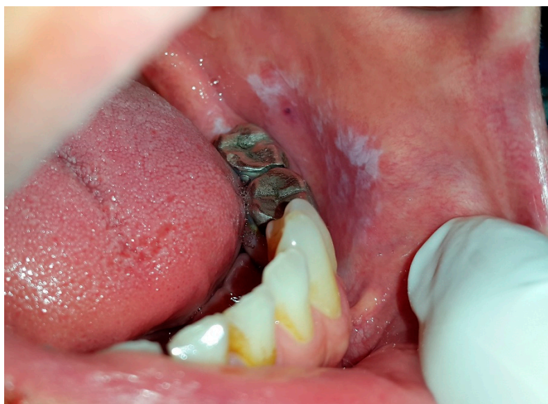
Figure 7. Lichenoid contact reaction in buccal mucosa and alveolar ridge due to amalgam build-up of 1st and 2nd mandibular molar.

No prevalence rate has been reported for LCR yet. Women are affected more frequently than men. Clinically, LCRs show the same features as seen in OLP, that is, reticulum, papules, plaques, erythema, and ulcers [4,5]. The most apparent clinical difference between OLP and LCR is the extension of the lesions. The majority of LCRs are confined to sites just in contact with dental materials, such as the buccal mucosa and the lateral borders of the tongue. Lesions are hardly ever observed in sites such as the gingivae, palatal mucosa, floor of the mouth, or dorsum of the tongue. Most LCRs are non-symptomatic, but the patient might experience discomfort from spicy and hot food when the lesion converts to erythematous or ulcerative forms. The duration of contact with dental material has the key role to develop LCRs on the oral mucosa. Lichenoid reactions caused by dental composites have been observed on the mucosal side of both upper and lower lips. Replacement of dental materials in direct contact with LCR will result in cure or considerable improvement in at least 90% of the cases within one to two months [4,5,30]. However, it is not necessary to replace restorative materials that are not in direct contact with LCRs. While a malignant potential for LCRs has been suggested, no prospective studies have been conducted to support this hypothesis [4].