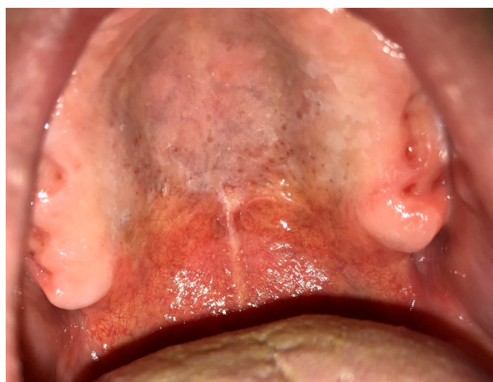
Figure 12. Nicotinic stomatitis on the hard palate.

Nicotine stomatitis is a usual white lesion due to smoking, which is also called Nicotine Palatines or smoker's palate [4,5]. This condition is commonly seen among heavy smokers of pipe, tobacco, cigarettes, and reverse smokers as well as patients who drink extremely hot beverages habitually. A frequency of 0.1% to 2.5% has been reported with a predilection for men older than 45 years [4,5,7]. Albeit both high temperature and chemical ingredients of smoke have synergistic effects on developing nicotine stomatitis, the impact of high temperature is much higher than that of chemicals. Nicotine stomatitis primarily presents as an erythematous area on the posterior rugae; then the lesion converts to diffuse leathery grayish-white palatal plaque. Red points can also be seen on the white mucosa that are actually widened and swollen orifices of accessory salivary glands with periductal nodular keratinization (Figure 12).