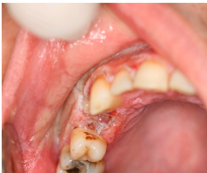
Figure 3. Superficial oral burn due to placement of an over-the-counter anaesthetic gel.

Some of well-documented caustic materials are aspirin, sodium perborate, hydrogen peroxide, gasoline, turpentine, rubbing alcohol, battery acid, isopropyl alcohol, phenol, eugenol, carbamide peroxidase, bisphosphonates, chlorpromazine, and promazine [5,13]. Thermal burn usually is mild and affects just a small area as a sloughy yellow-white necrotic epithelium with areas of erythema and ulceration [5,13,14]. However, chemical burns result in mucosal necrosis with more severe clinical features [13]. In case of short-time exposure to chemicals, the superficial mucosa becomes white and wrinkled, but longer exposures lead to denudation of the epithelial layer and development of a yellowish, fibrinopurulent membrane over the area [5]. Most cases of mucosal burns have little clinical effects and improve without treatment [5,13]. Use of rubber dam is a preventive technique in order to decrease iatrogenic mucosal burns [5]. According to the size and symptoms of the lesions, some recommendations are proposed to manage these conditions such as use of non-steroidal anti-inflammatory drugs (NSAID's), antibiotics, antiseptic mouthwashes, coverage with a protective emollient paste or a hydroxypropyl cellulose film, topical anesthetics, and surgical debridement [5,15] (Table 2).