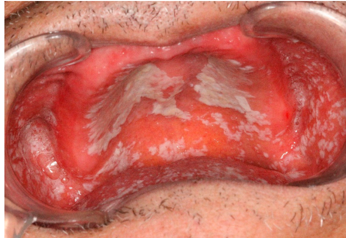
Figure 4. Pseudomembranous candidiasis due to using broad spectrum antibiotic; pseudo membranes can be scraped off by a piece of gauze.

dentate patients and more than 60% of edentulous individuals with a female predilection [4]. The acute pseudomembranous form of oral candidiasis is usually seen in infants due to their underdeveloped immune system, the elderly because of their compromised immunity and patients on broad-spectrum antibiotics [4,17] (Figure 4).