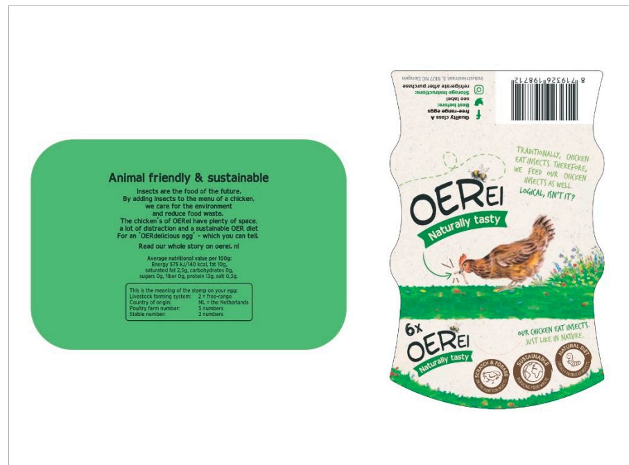
Figure 2. Packaging provided to participants during Section 4 of the focus groups.