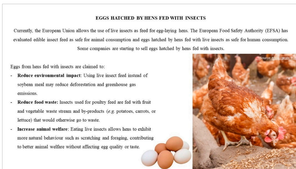
Figure 1. Information card provided to participants during Section 3 of the focus group.

Section 3: Participants were provided with an information card about the benefits of feeding hens with insects (Figure 1). The provision on the information card allowed participants to generate and explore knowledge and opinions about a new product that was not yet in the UK market. After the provision of the information, participants were asked to express their perceptions towards the product and related benefits to identify their level of acceptance.