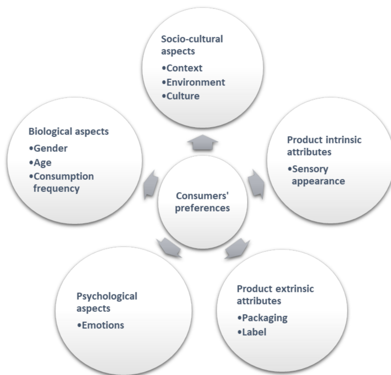
Figure 1. Factors that influence consumers' preferences. Adapted from [22,112–114].

Many factors, including biological, psychological, and socio-cultural, may influence consumers' preferences and choices (Figure 1) [22]. Gender, age, consumption frequency, education, and income are just a few examples of those many variables that affect consumers' preferences and choices [112]. In addition, product-intrinsic attributes such as sensory appearance, product-extrinsic attributes such as label or packaging [113,114], and contextual and environmental influences may have clear effects on hedonic tasting [22].