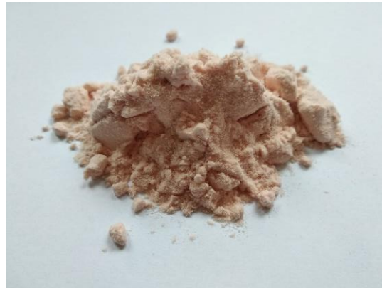
Figure 2. LF isolated from milk.

Isolated LF takes the form of a pale pink, odourless powder—Figure 2.