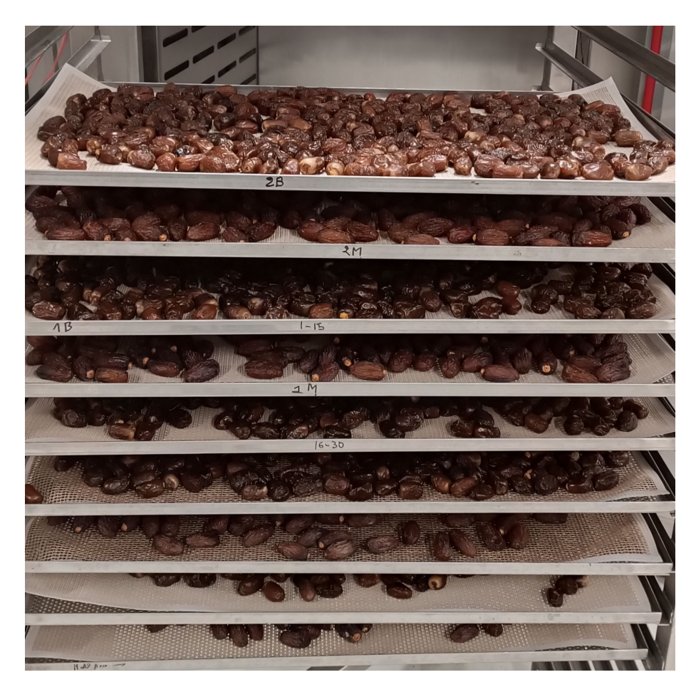
Figure 1. Illustration of convective drying of 'Mejhoul' and 'Boufeggous'.

For each technological repetition, date fruit samples were spread out in one layer into trays placed at different levels of the drying chamber rack (Figure 1). Each tray contained approximately 3–4 kg of 'Mejhoul' or 'Boufeggous' to provide a total amount of dried material of approximately 25–26 kg per cultivar and per technological repetition. This process was performed through hot air at a temperature of 60 °C, and the airflow side (right or left) was changed every 10 min. This process was carried out until reaching the desired weight loss and estimated water content (achieved in 240 min).