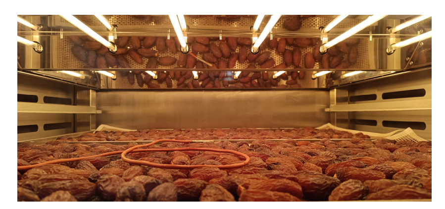
Figure 2. Illustration of infrared drying of 'Mejhoul'.