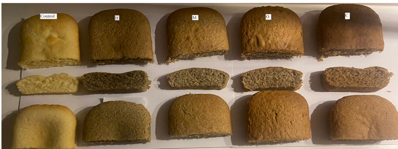
Figure 1. Image of gluten-free baton cake samples.

The quantities of hemp (H), coriander (C), okra (O), and mustard (M) seed flours used in the gluten-free baton cake production were adjusted to 25% of the mixture of seed flour and rice flour, and 5 different cake productions were carried out. The formulations of the flour mixtures used in the cakes' production are shown in Table 1. For cake production, 110 g of eggs and 200 g of sugar were whisked for a certain period, followed by the addition of 110 mL of vegetable oil, 150 mL of milk, 270 g of flour mixture, and 1.5 g of baking powder as specified in the formulation. In the production of baton cake, initially, eggs and sugar were mixed with a mixer at maximum speed for 5 min. Then, vegetable oil and milk were added and mixed for 1 min. Finally, the gluten-free flour mixture was added. The prepared cake mixtures were baked at 180 °C for 15 min (Figure 1).