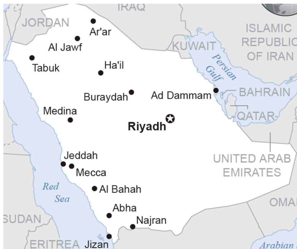
Figure 1. Regions [western (Jeddah), eastern (Dammam), northern (Buraydah) and central (Riyadh)] where produce (fruits and vegetables) were purchased.