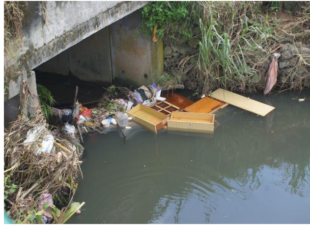
Sample spot viewed at upstream sites of Perak River.