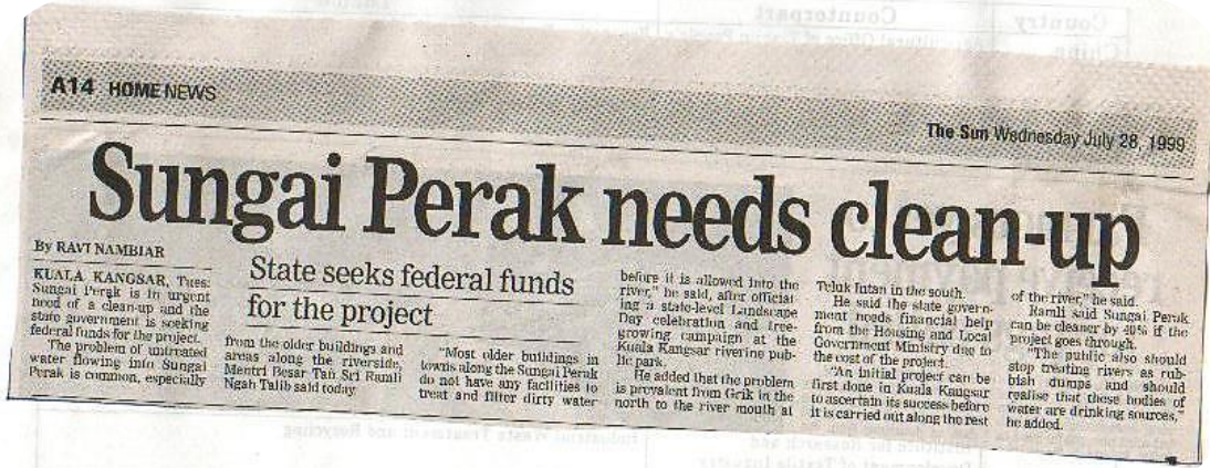
Newspaper article on 28 July, 1999.