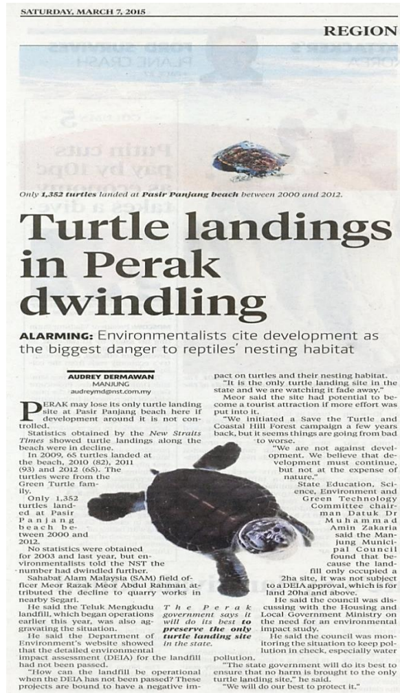
Newspaper article on 7 March 2015