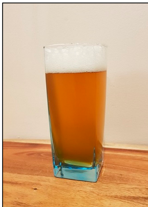
Figure 1. The photograph of the beer presented to participants.

demand characteristics that might be present if the MSIS was presented before assessing expectations regarding the beer. Participation took approximately 10 min.