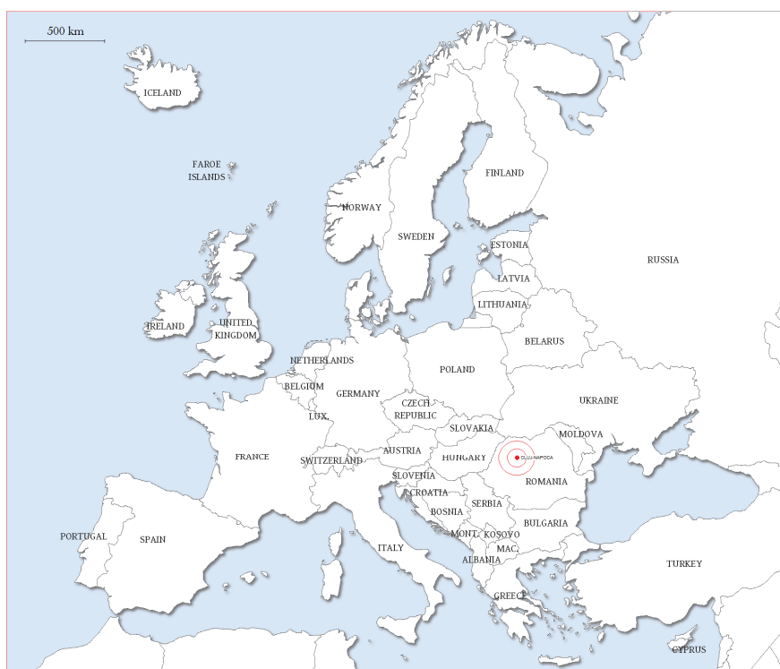
Figure 1. Location of Cluj-Napoca and North-Western Romania in Europe (map adapted from www.freeworldmaps.net ).

This study presents a cross-sectional description of these laboratory data obtained between May 2016 and April 2020 by mycological diagnosis.