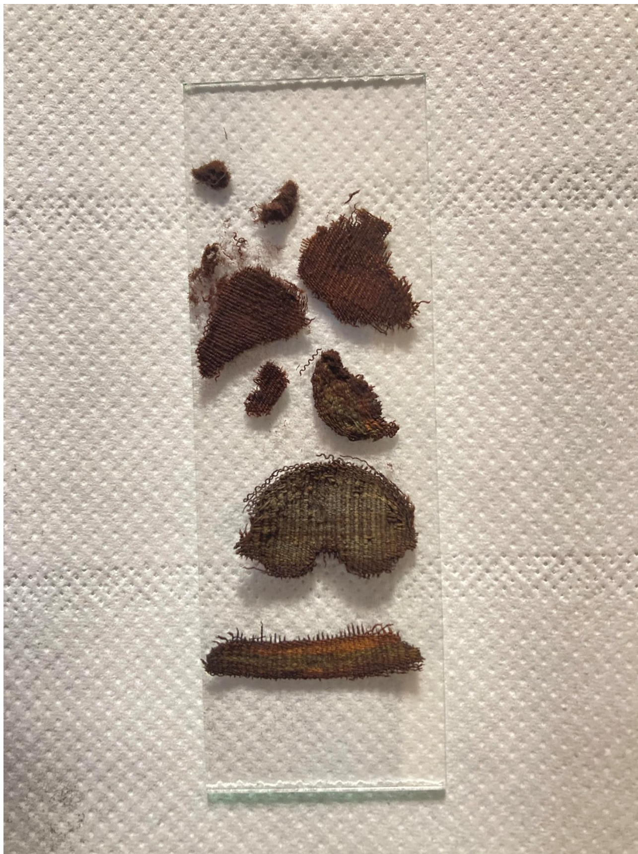
Figure S1: the historical samples from Tutankhamun's tomb analysed in the paper, constituted by archaeological textile fragments.