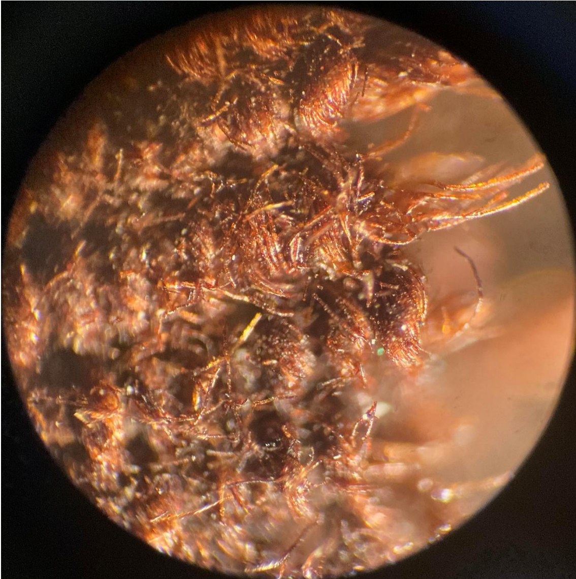
Figure S2: a 10x magnification image of a red area on the analysed textile fragment.