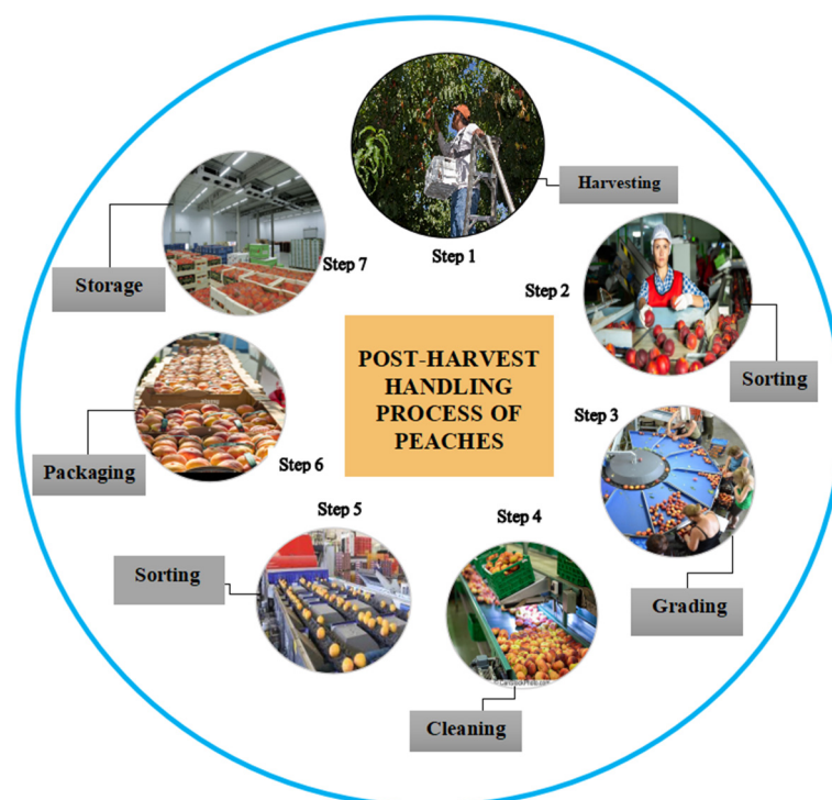
Figure 1. Processing of peaches after harvest.

quality and extending its shelf life are challenging problems for the peach sector [1–3]. One of the primary issues is that peaches are susceptible to damage during handling, which can lead to bruising and decay. Peaches should be stored in the proper circumstances to prevent rapid ripening and softening [4,5]. Post-harvest handling and ripening are key stages in the peach industry because they have a direct impact on the quality, shelf life, and market value of the fruit [6]. Peaches are perishable fruits, and their quality degrades quickly after harvesting. Proper post-harvest handling techniques are critical for minimizing losses, maintaining fruit quality, and ensuring that peaches reach consumers in optimum shape [7]. Harvesting, sorting, grading, cleaning, and packaging are merely some of the procedures that make up post-harvest handling [Figure 1] [8]; multiple factors, including temperature, humidity, ethylene exposure, and mechanical damage, have an impact on the quality of peaches during this stage. To develop efficient handling and ripening processes for peaches, it is essential to comprehend their post-harvest physiology [9].