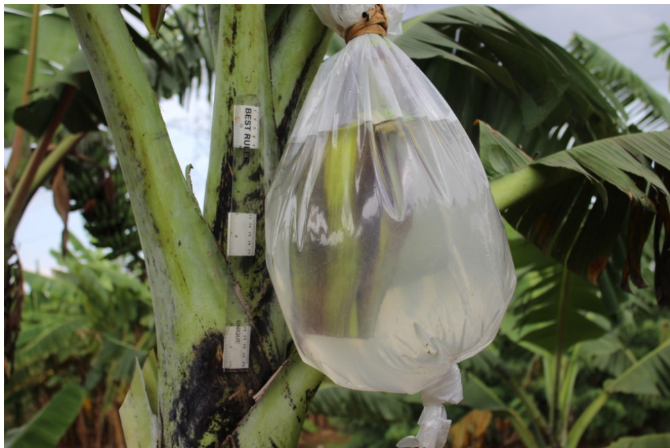
Figure 1. A ‘Mbuzirume’ bunch immersed in a 0.031 M saline solution treatment for seed set increase a day before the start of pollination.

repeated until all hands were pollinated. Pollinated bunches were then labeled and left to mature in the open. Water was included as a negative control, as summarized in Table 2.