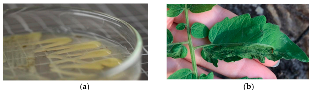
Figure 1. The yellowish bacteria X. arboricola NRCIB X8 (a) and hypersensitive reaction test on tomato (b).

(NRCIB X6) and four as X. arboricola (Xa) (NRCIB X7, NRCIB X8, NRCIB X9, and NRCIB X10) (accession numbers in GenBank: OL504772-OL504776).