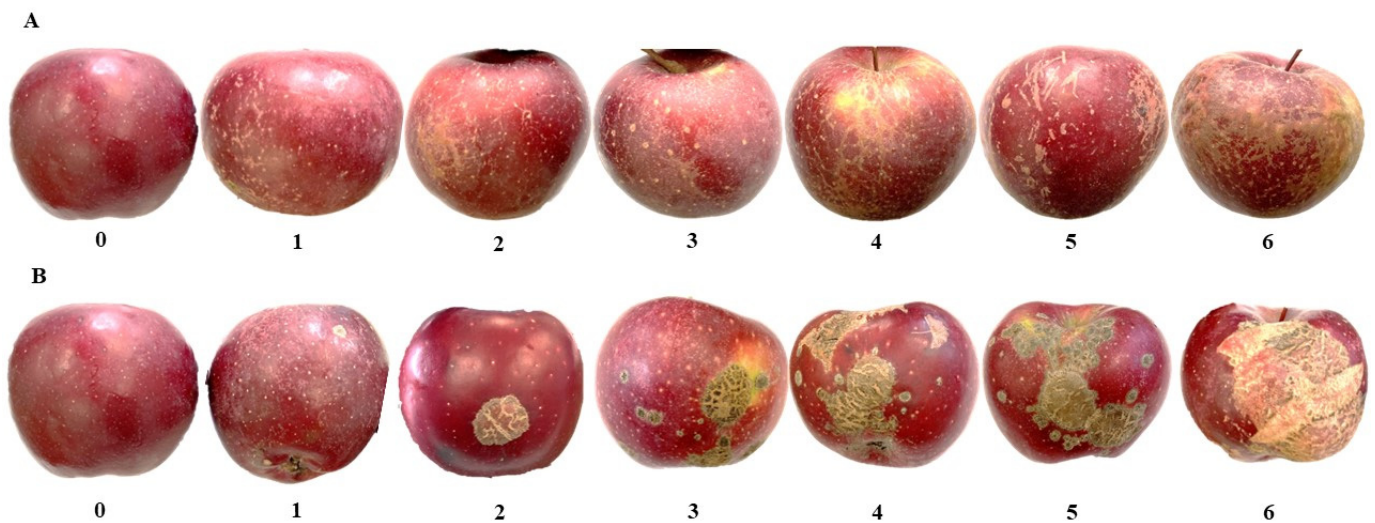
Figure 1. Representation for assessment of (A) apple russet severity and (B) apple scab severity on harvested fruit. Each fruit was assigned a rating (0–6) corresponding to the picture it most clearly resembled. These apples are medium sized (~8 cm in diameter).