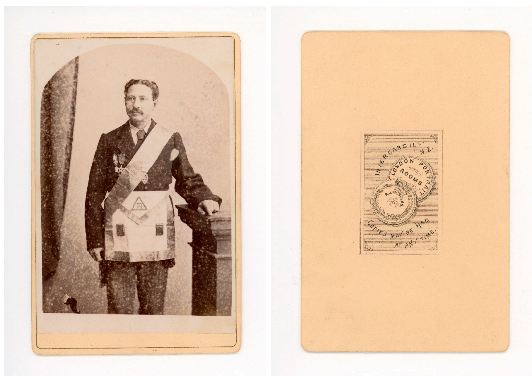
Figure 12. Unnamed Freemason. 1870s. Photograph: R. J. Nicholas, Invercargill, New Zealand. De Beer album, 1936/118/3, recto and verso. Collection of Toitū Otago Settlers Museum, Dunedin, New Zealand.